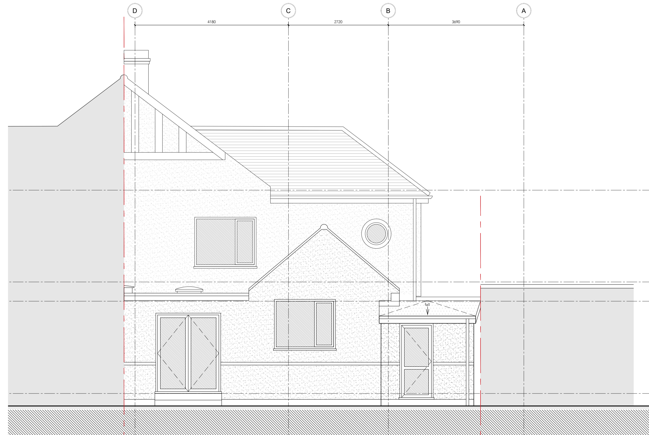
EXISTING: FRONT ELEVATION 01 Scale 1:50

No 31 Farwell Road No 29 Farwell Road No 27 Farwell Road