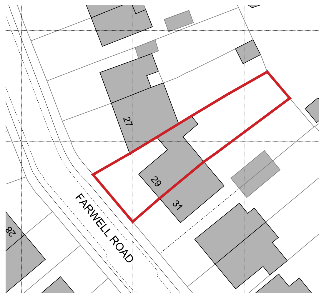
EXISTING BLOCK PLAN Scale 1:500