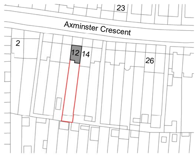
1 Site - EX 1250