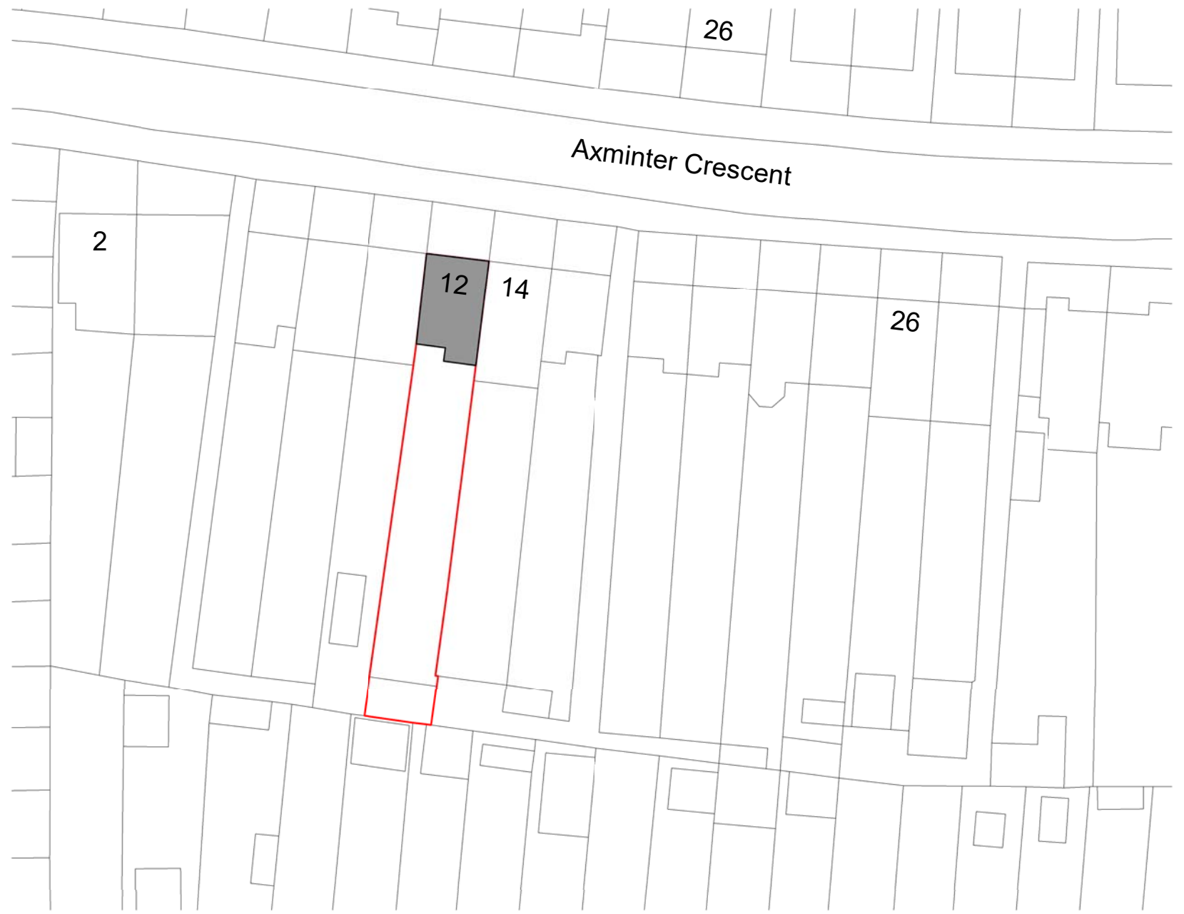
2 Site - EX 500