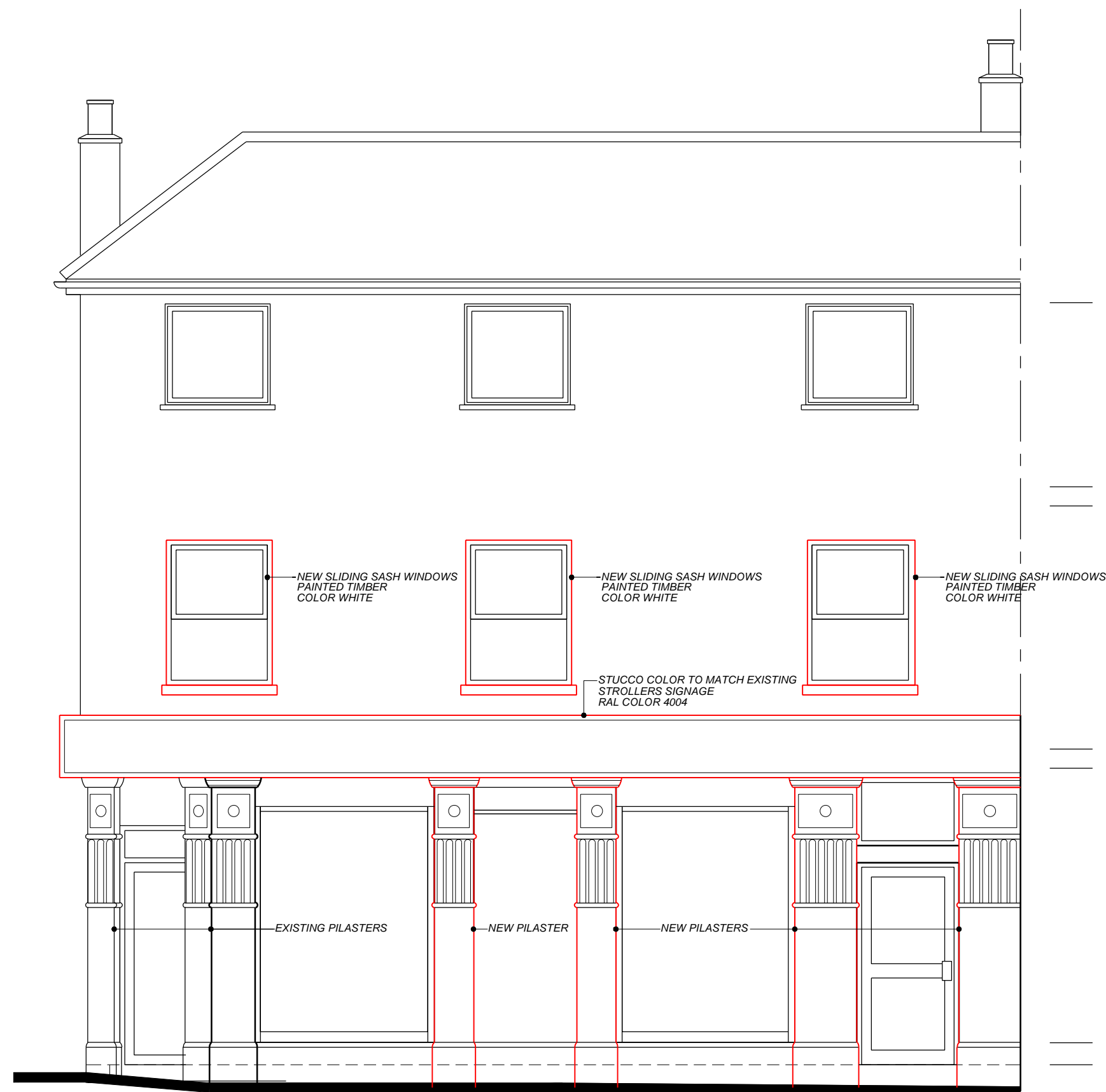
FRONT ELEVATION ( TO HIGH STREET )