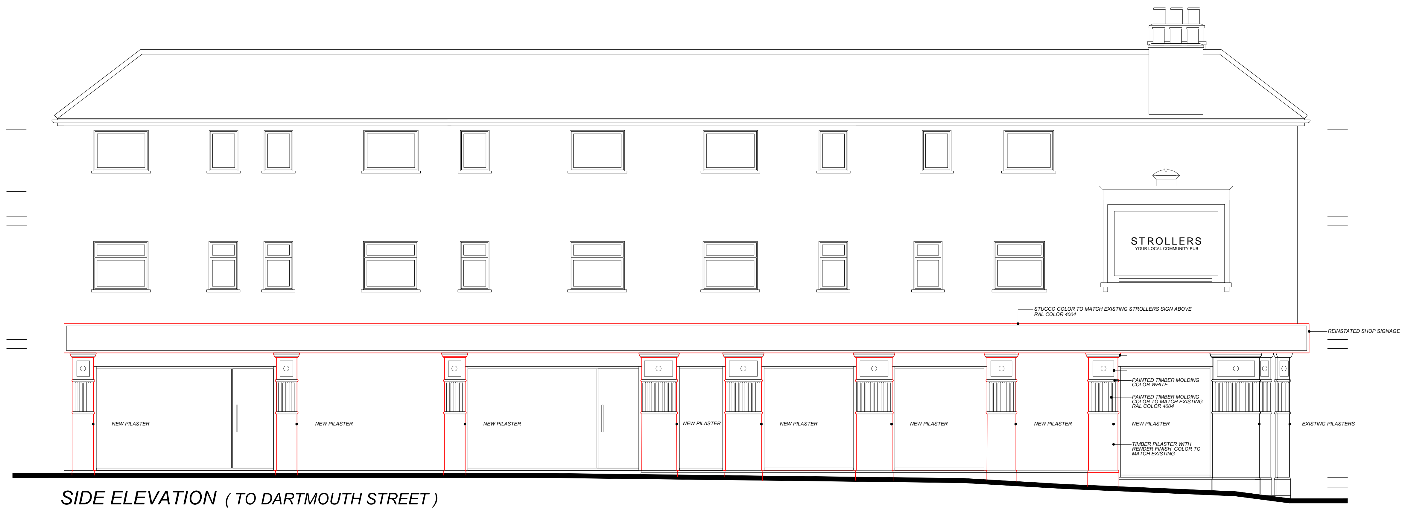
SIDE ELEVATION ( TO DARTMOUTH STREET )