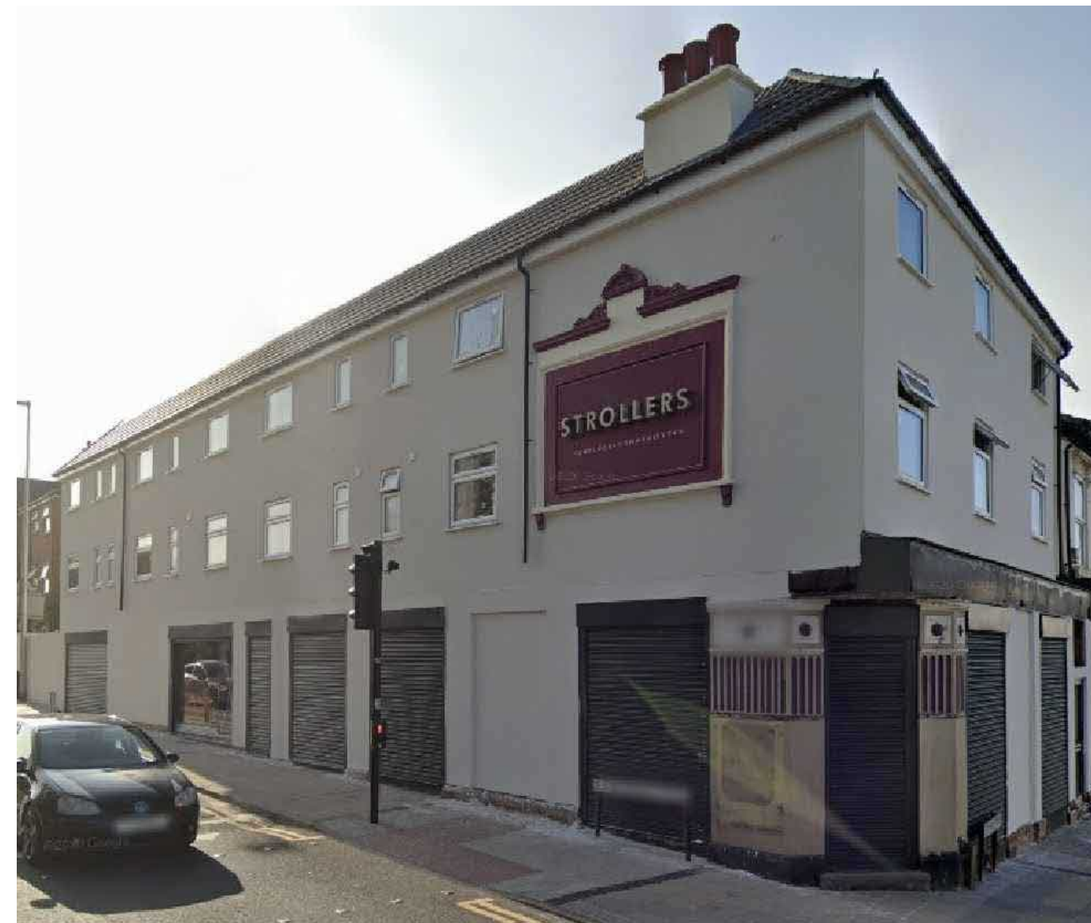
CURRENT BUILDING - AS BUILT