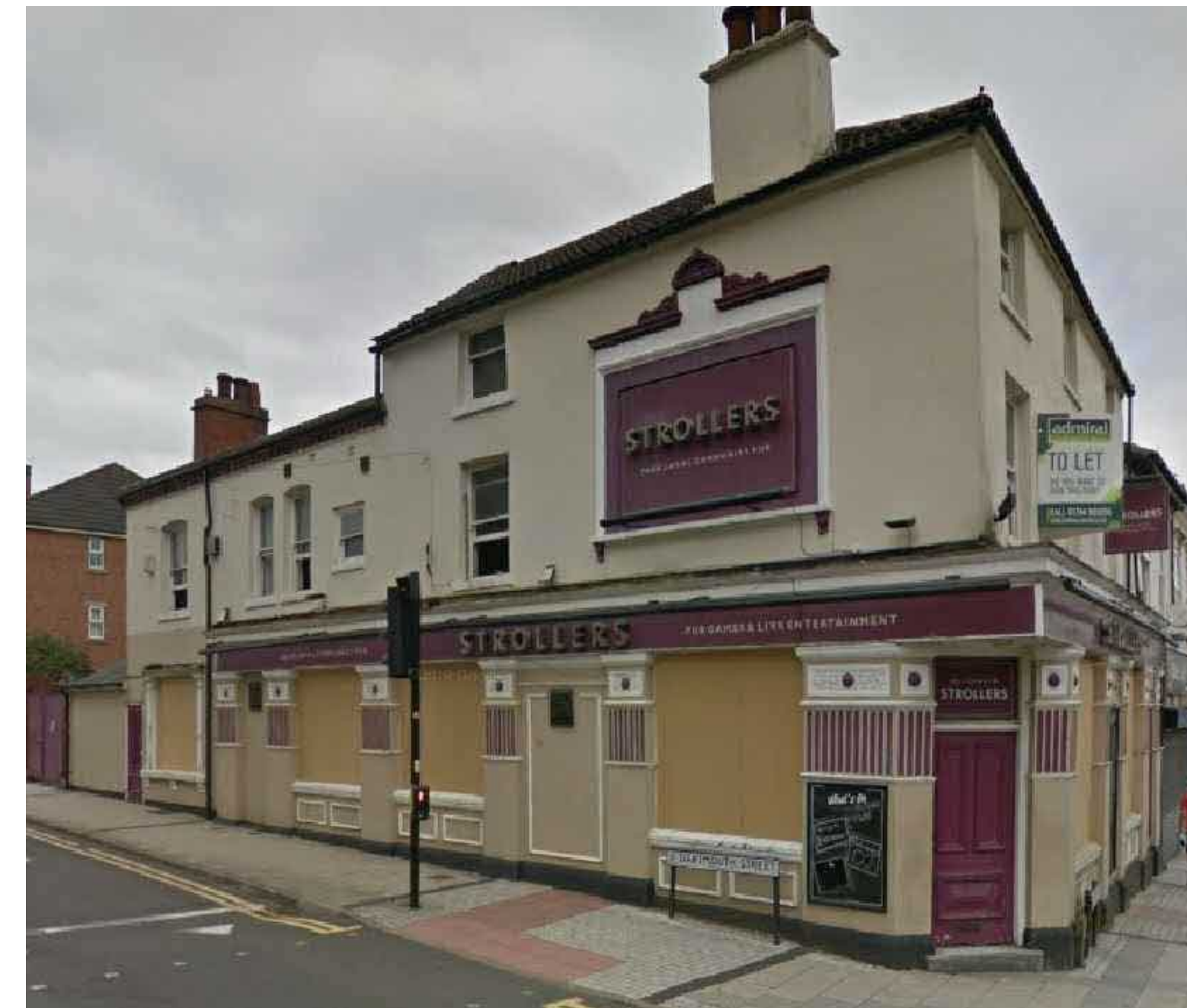
BUILDING PRIOR TO EXISTING ALTERATIONS