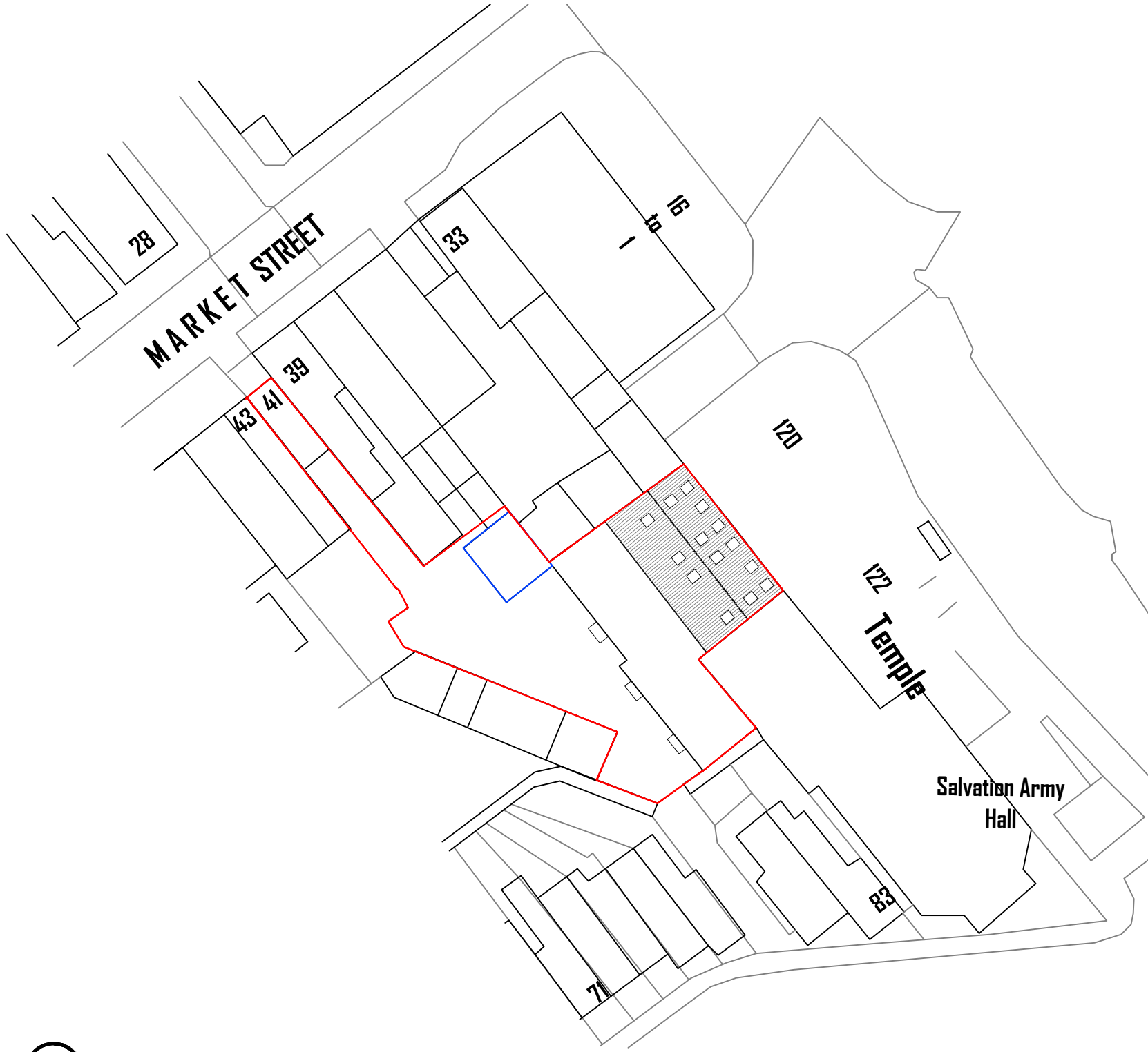
1 Proposed Block Plan