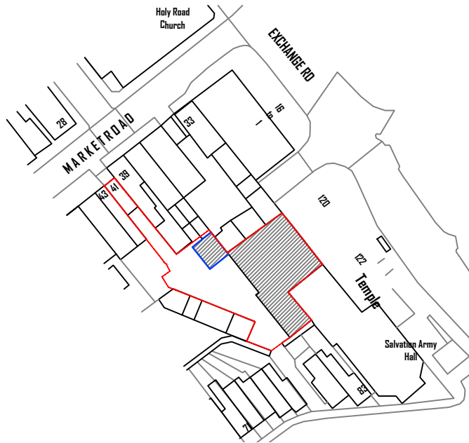
1 Location Plan