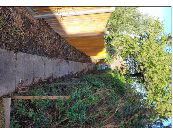
EXISTING PUBLIC PATH LEADS TO THE BACK