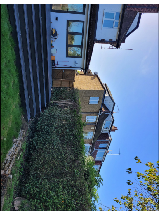
SIDE ACCESS TO THE PUBLIC PATH