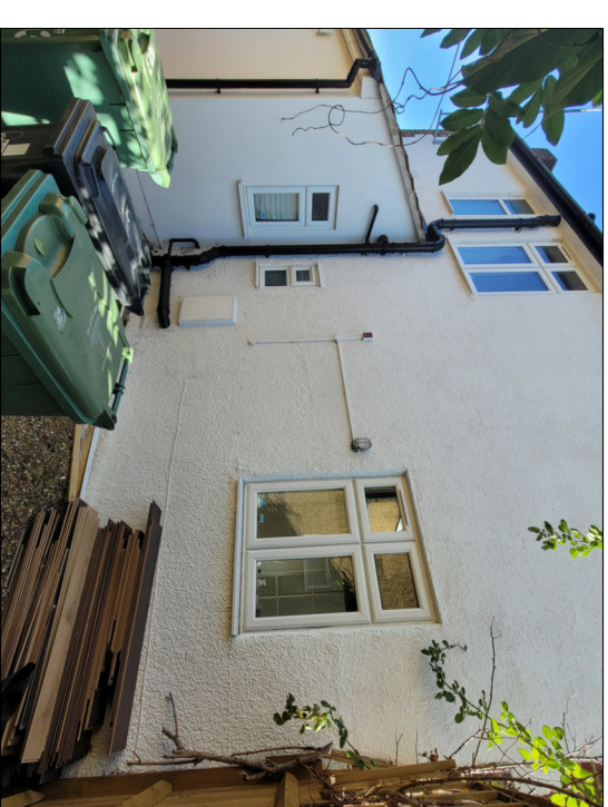
EXISTING SIDE EXTENSION