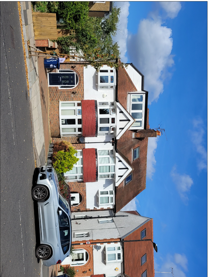
EXISTING FRONT VIEW OF No. 103 & 105