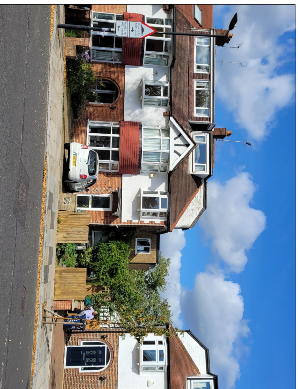
EXISTING PUBLIC BACK LANE BETWEEN No. 99 & 103