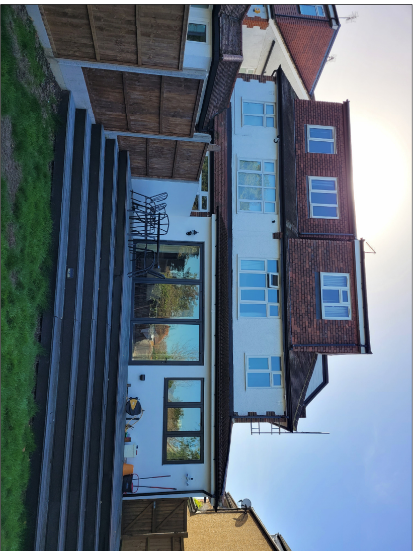
EXISTING REAR ELEVATION OF No. 103