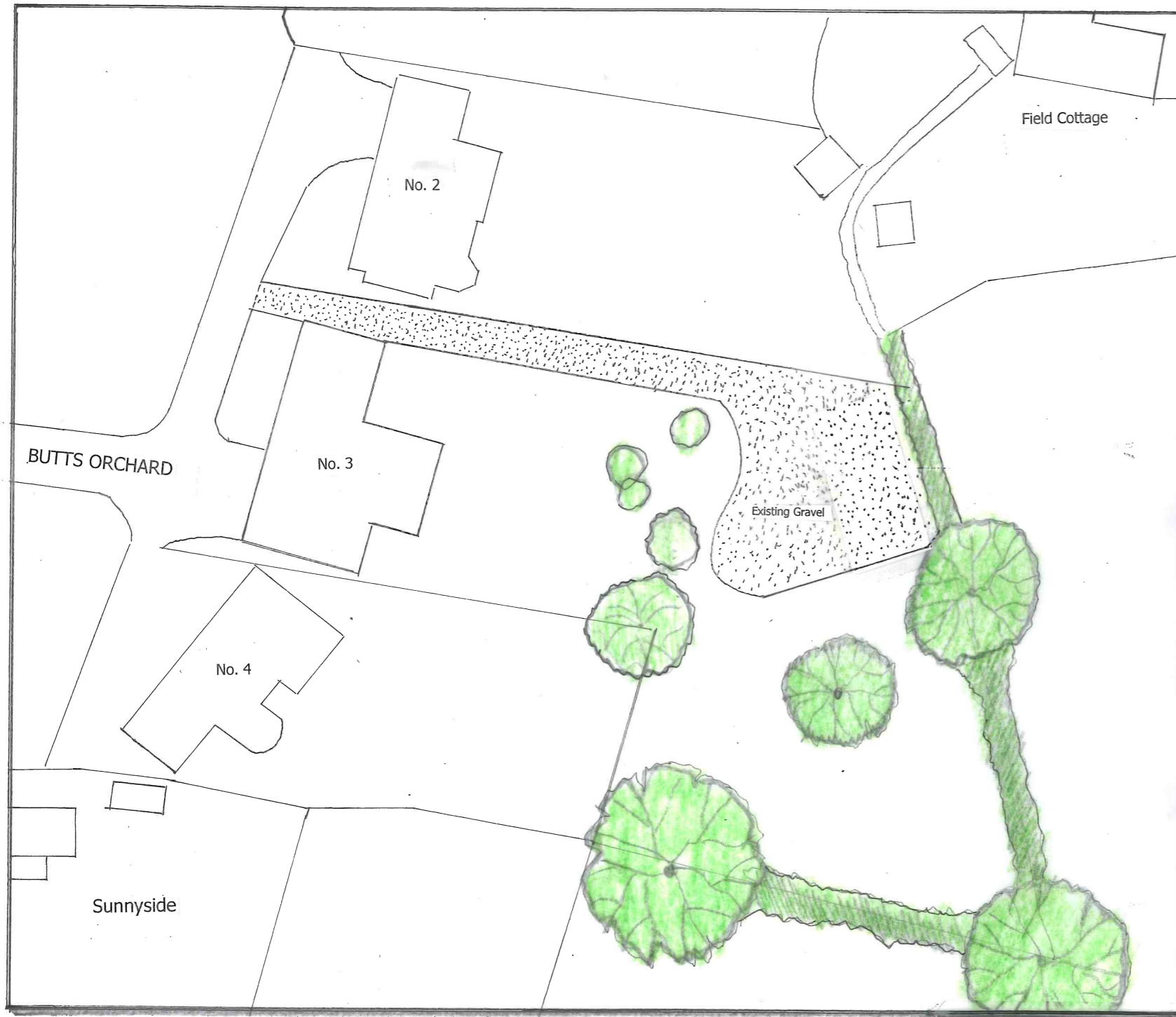
EXISTING SITE PLAN Scale 1 : 500