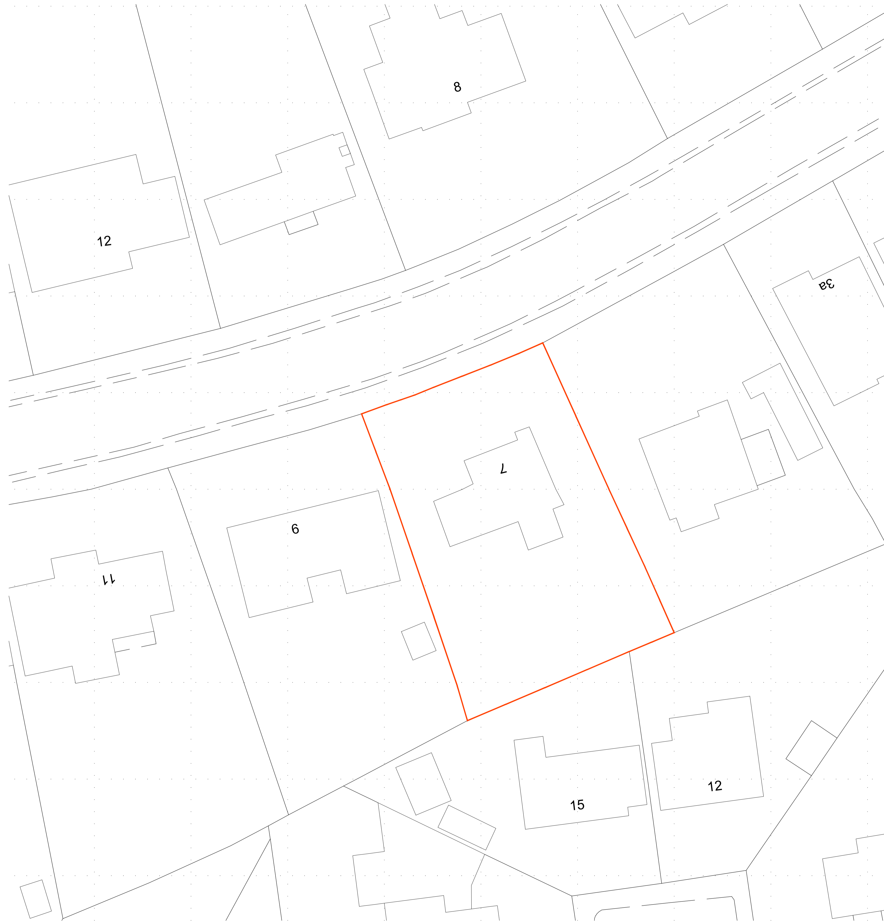
Existing Site Plan 0 10 20m SCALE: 1/ 200 @ A1

NOTES The Contractor is to check all dimensions and conditions on site before commencing. Do not scale from this drawing. Refer to SE DWGS. Comply with all Statutory Requirements