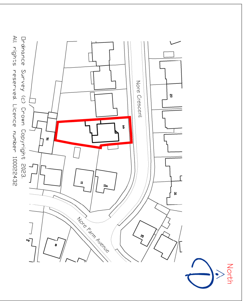
Existing Location Plan Scale 1:1250