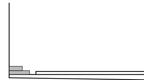
Section B-B (Scale 1:100)