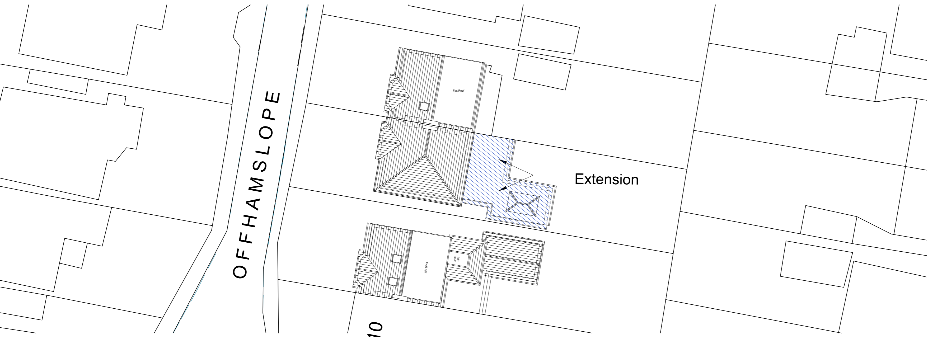
Block Plan as Proposed 1:200