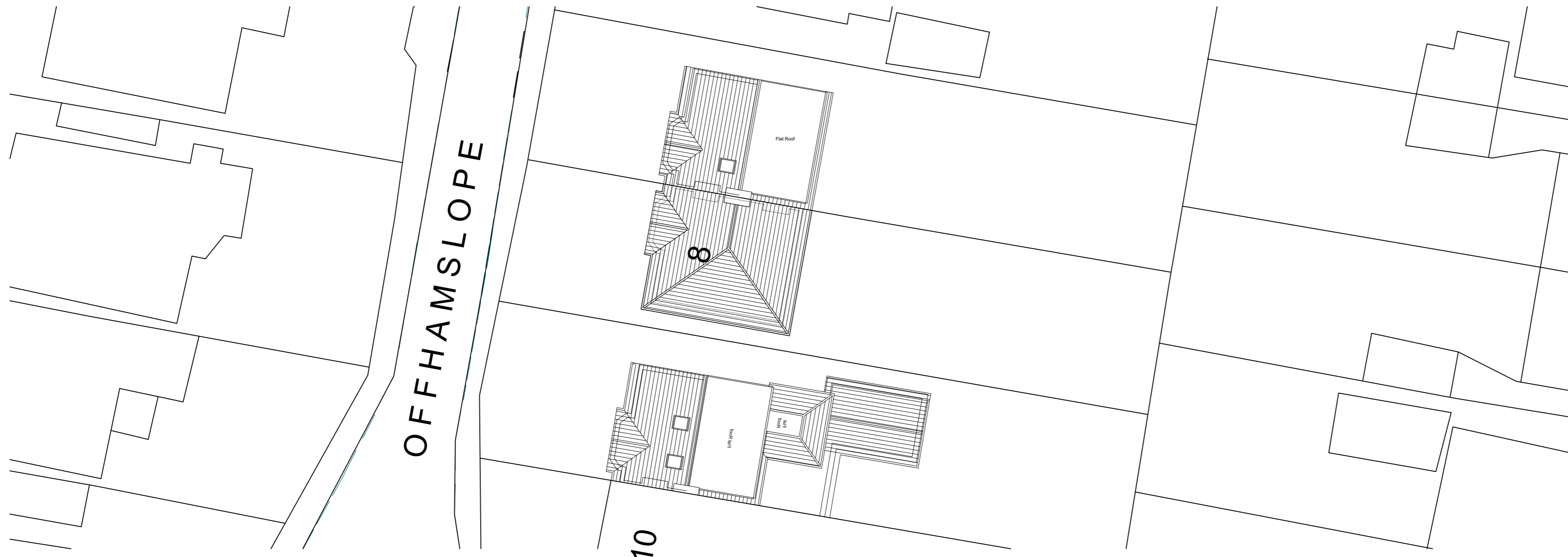
Block Plan as Existing 1:200