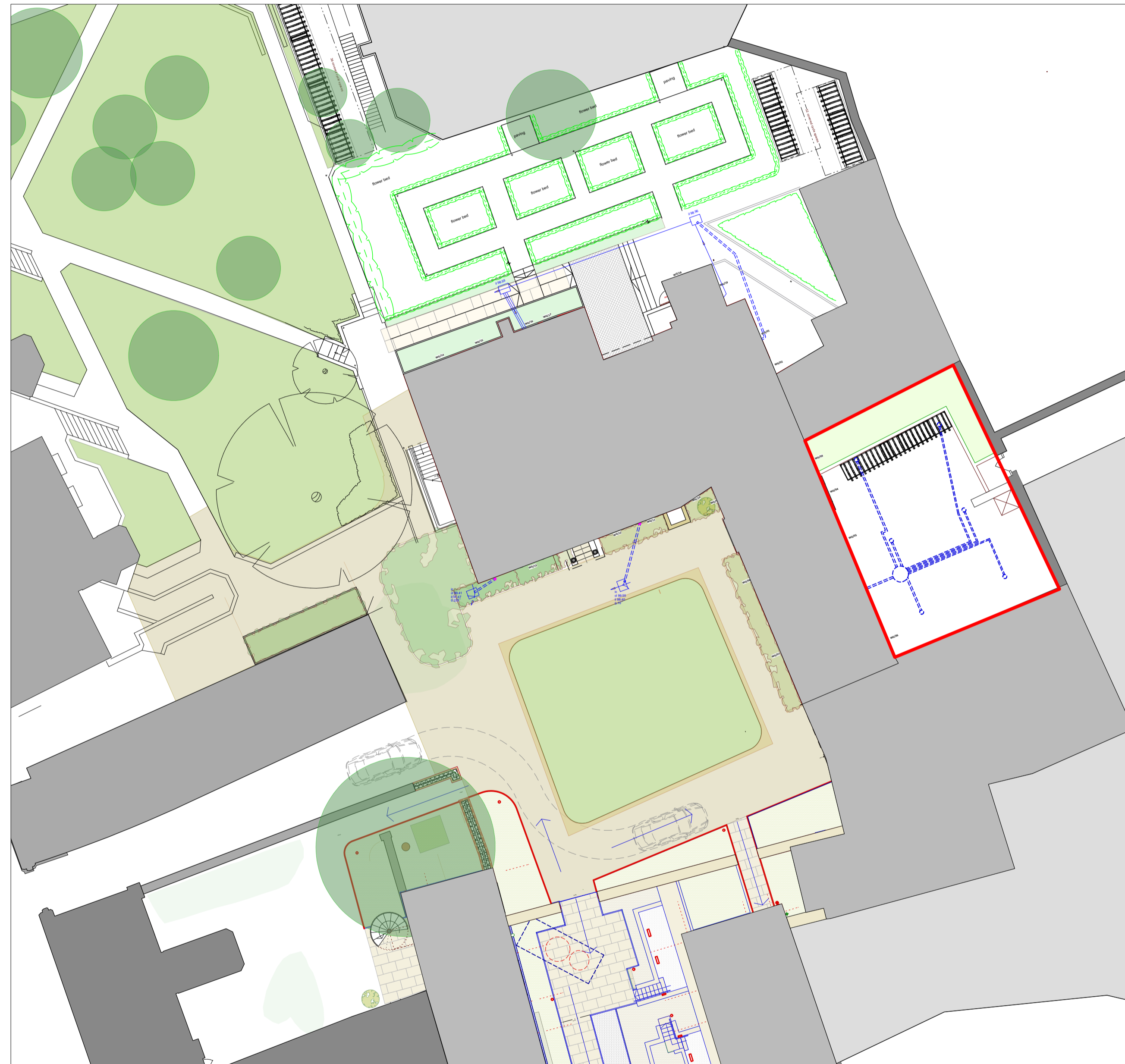
Block Plan 1:200