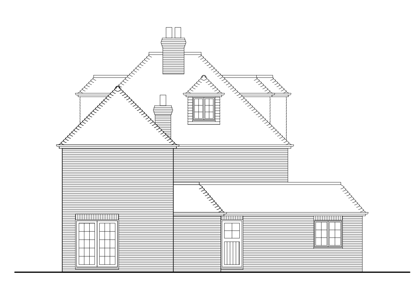
side - east