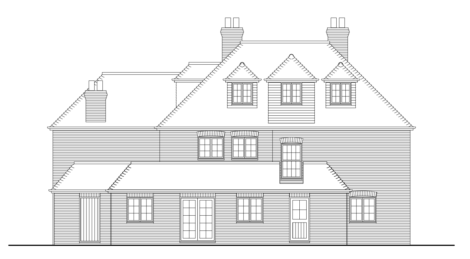
rear - north