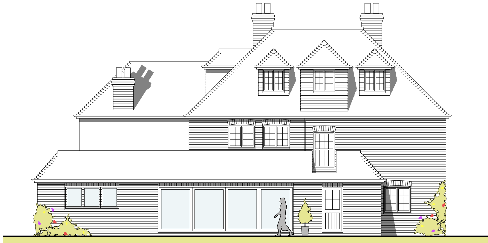
rear - north