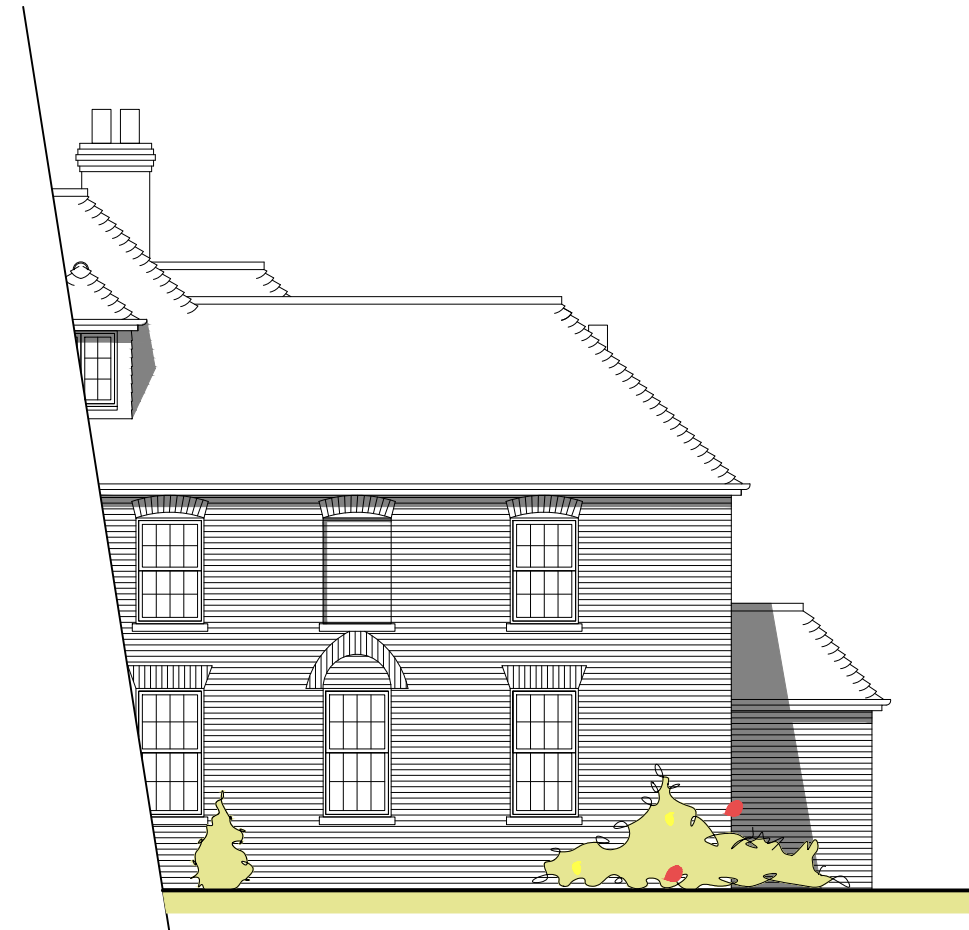
front - south