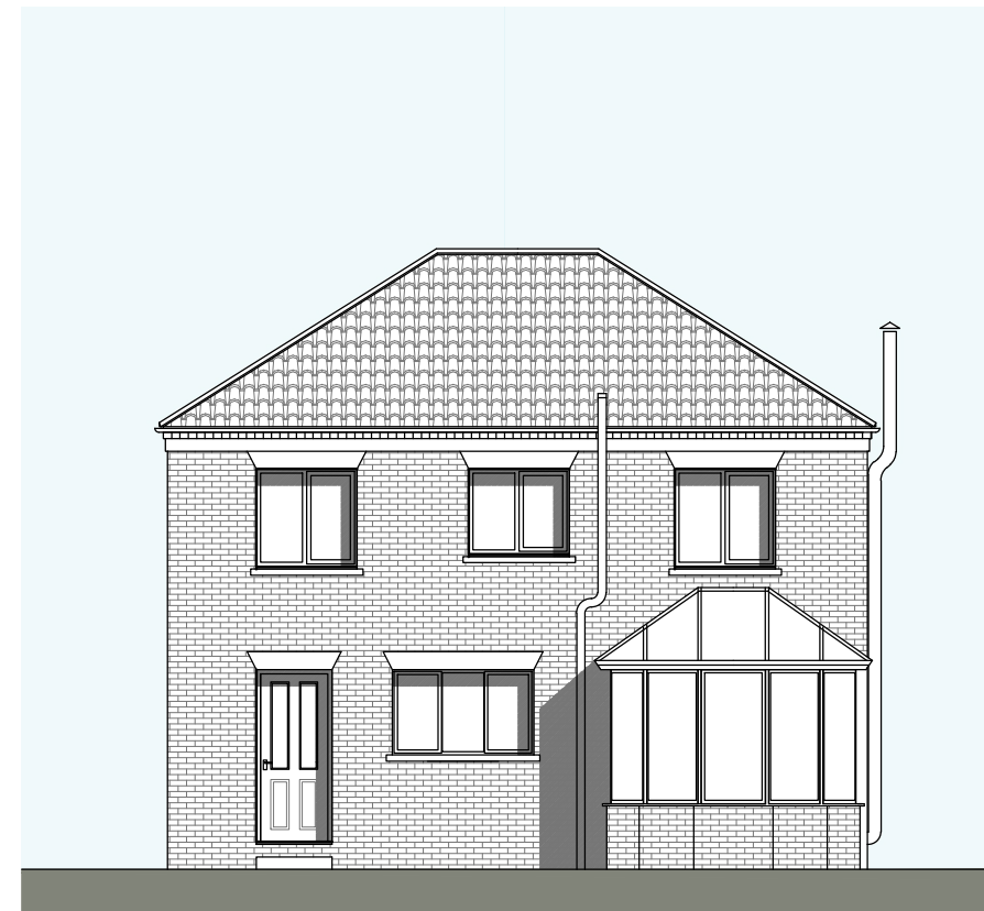
04 EXISTING REAR ELEVATION 1:100