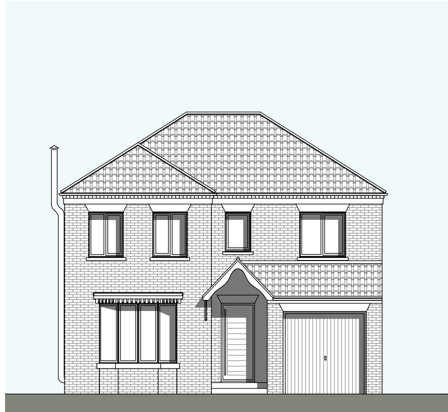
01 EXISTING FRONT ELEVATION 1:100