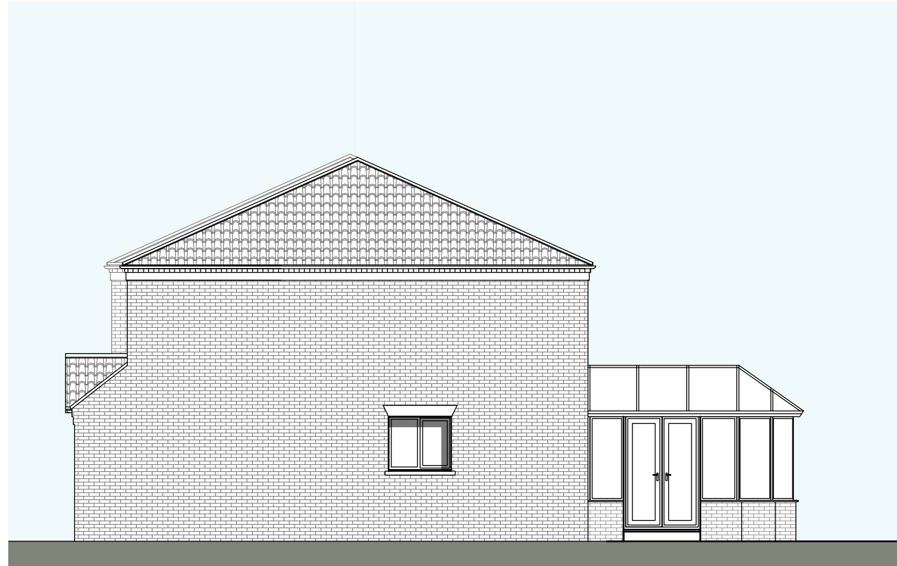
02 EXISTING SIDE ELEVATION 1:100