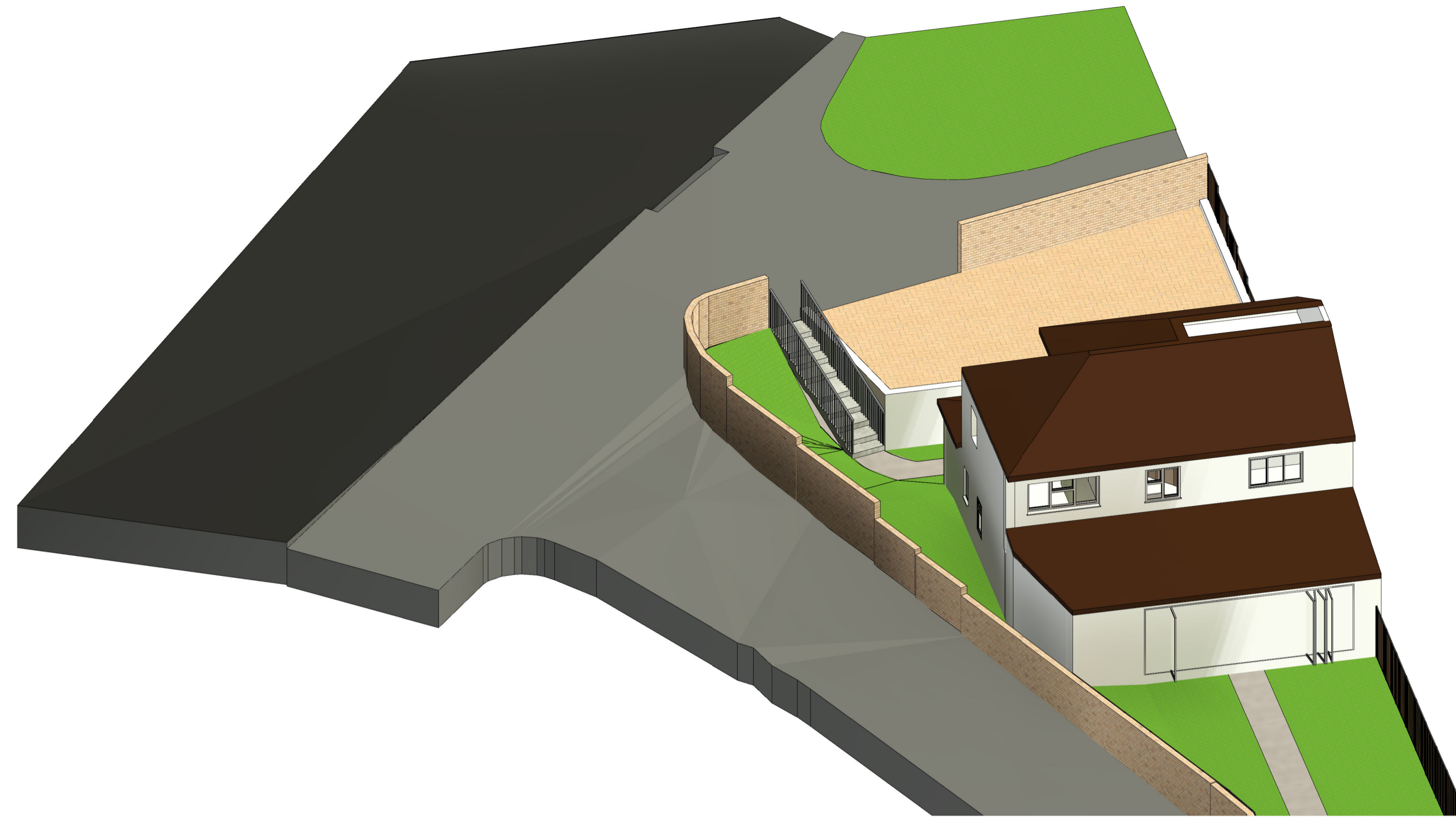
Proposed Rear 3D View