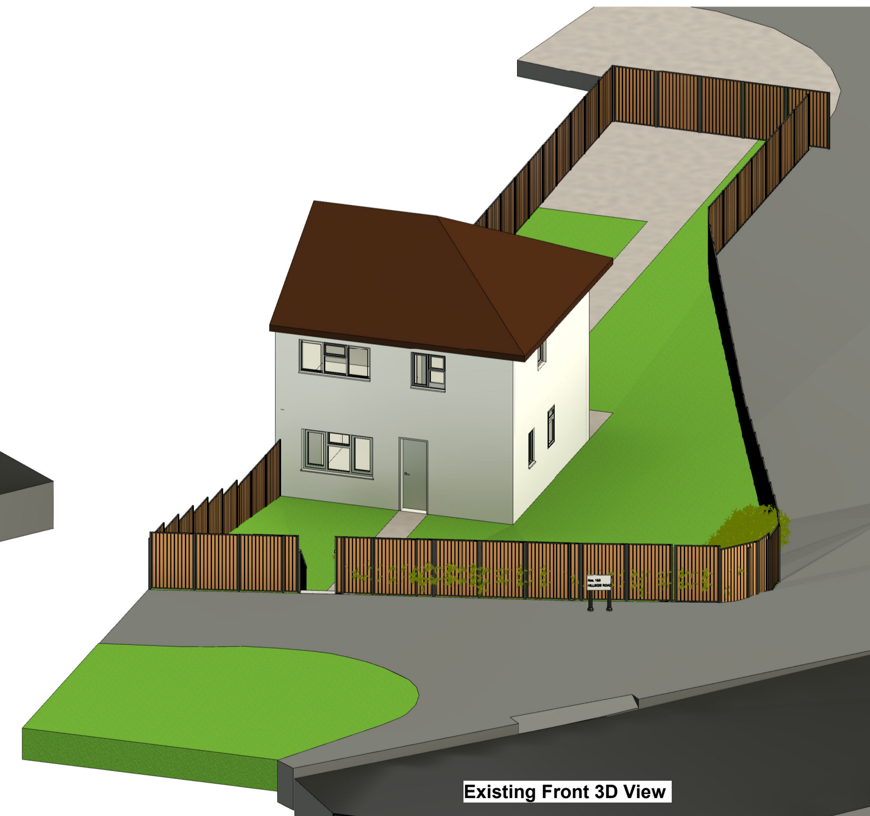
Existing Front 3D View