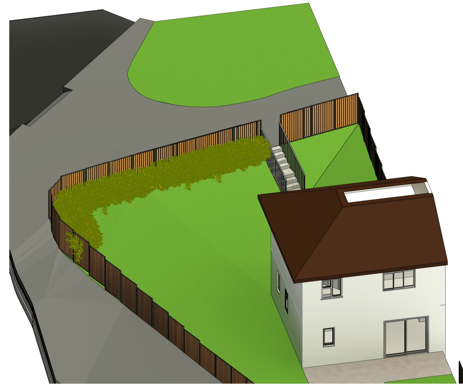
Existing Rear 3D View