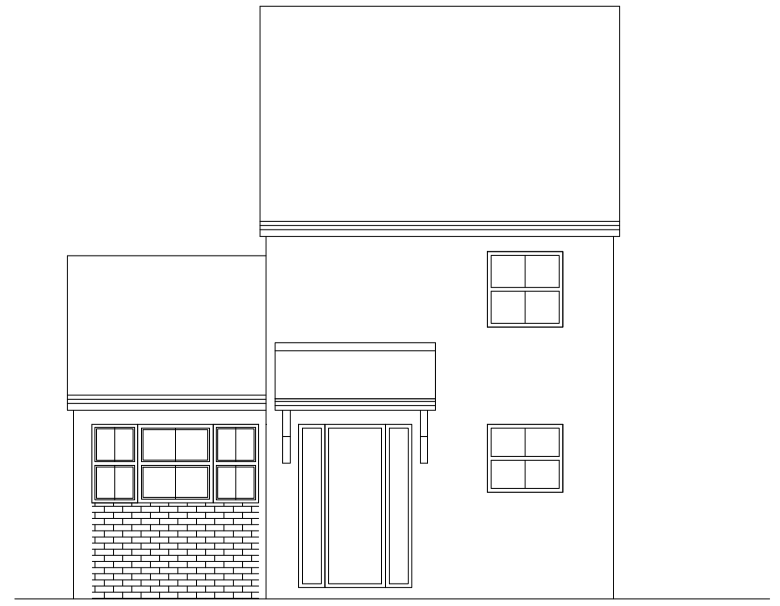
PROPOSED FRONT ELEVATION (scale 1:50)