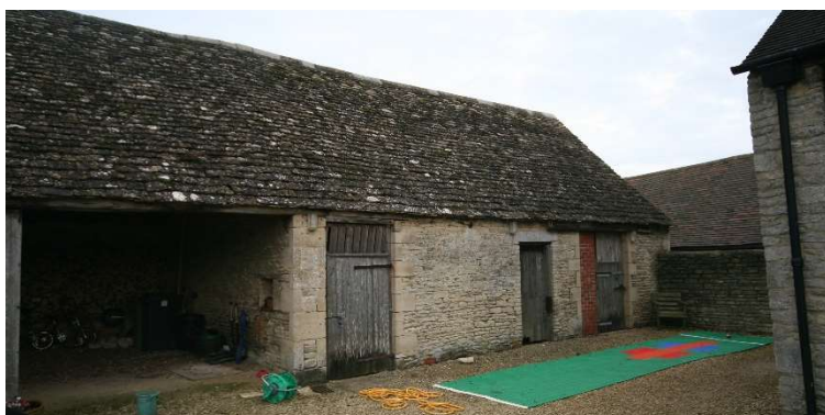
Existing West façade to the internal stores

The existing roof trusses are retained and left exposed in the finished works. A number of conservation style rooflights are proposed, to match those found on the main house, shedding natural light into the open roof space and rooms below. To minimise disturbance to the stone roof, these have been located on the rear (East slope) of the building, as this is clad in the modern plain roof tiles.