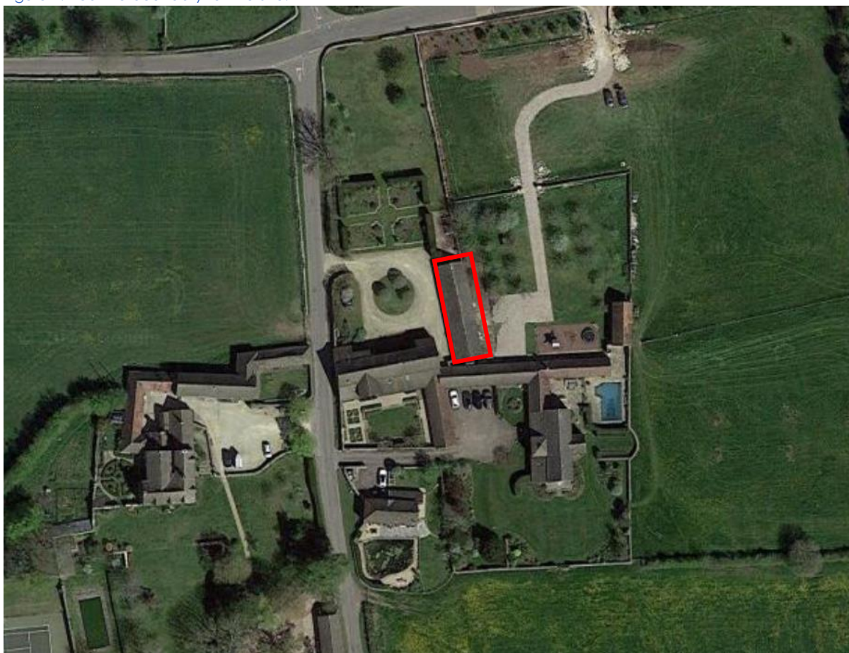
Figure 1. Red line boundary for the Site.

Building 1 – Manor Farm Barn, hereafter referred to as 'the Site', is situated in the village of Culkerton. (NGR ST 93171 95827). An aerial photo view of the site can be seen in Figure 1 below.