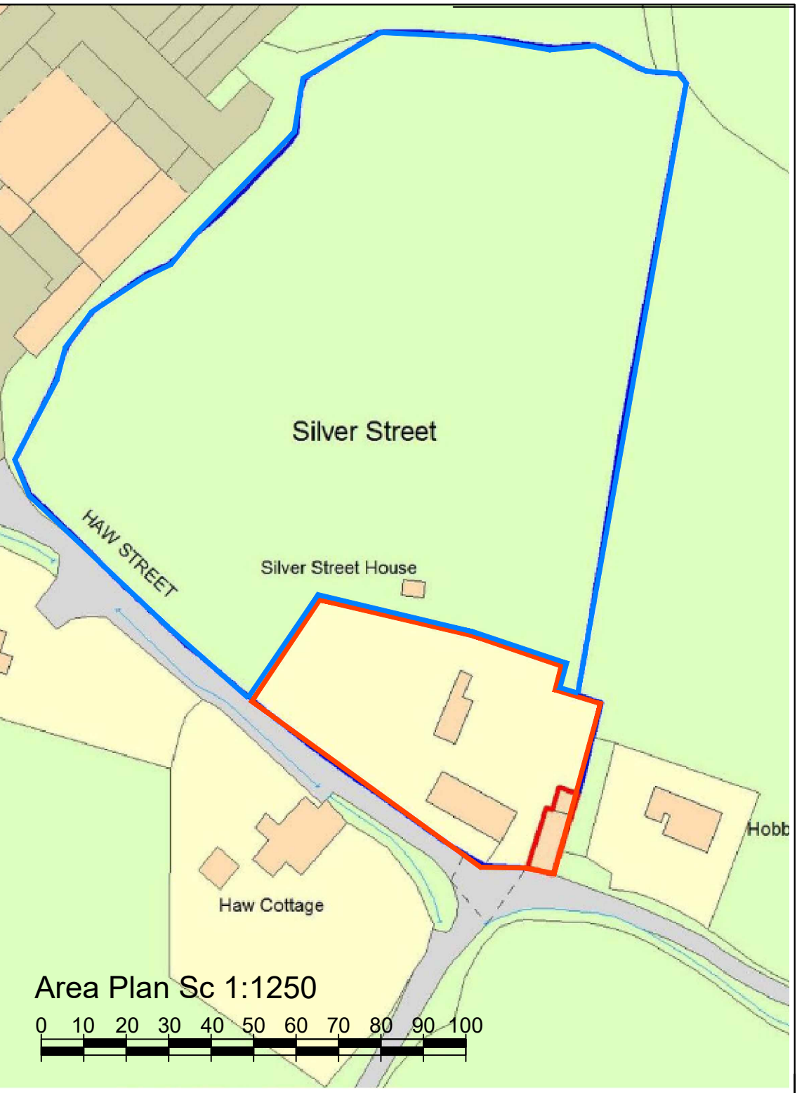
Area Plan Sc 1:1250