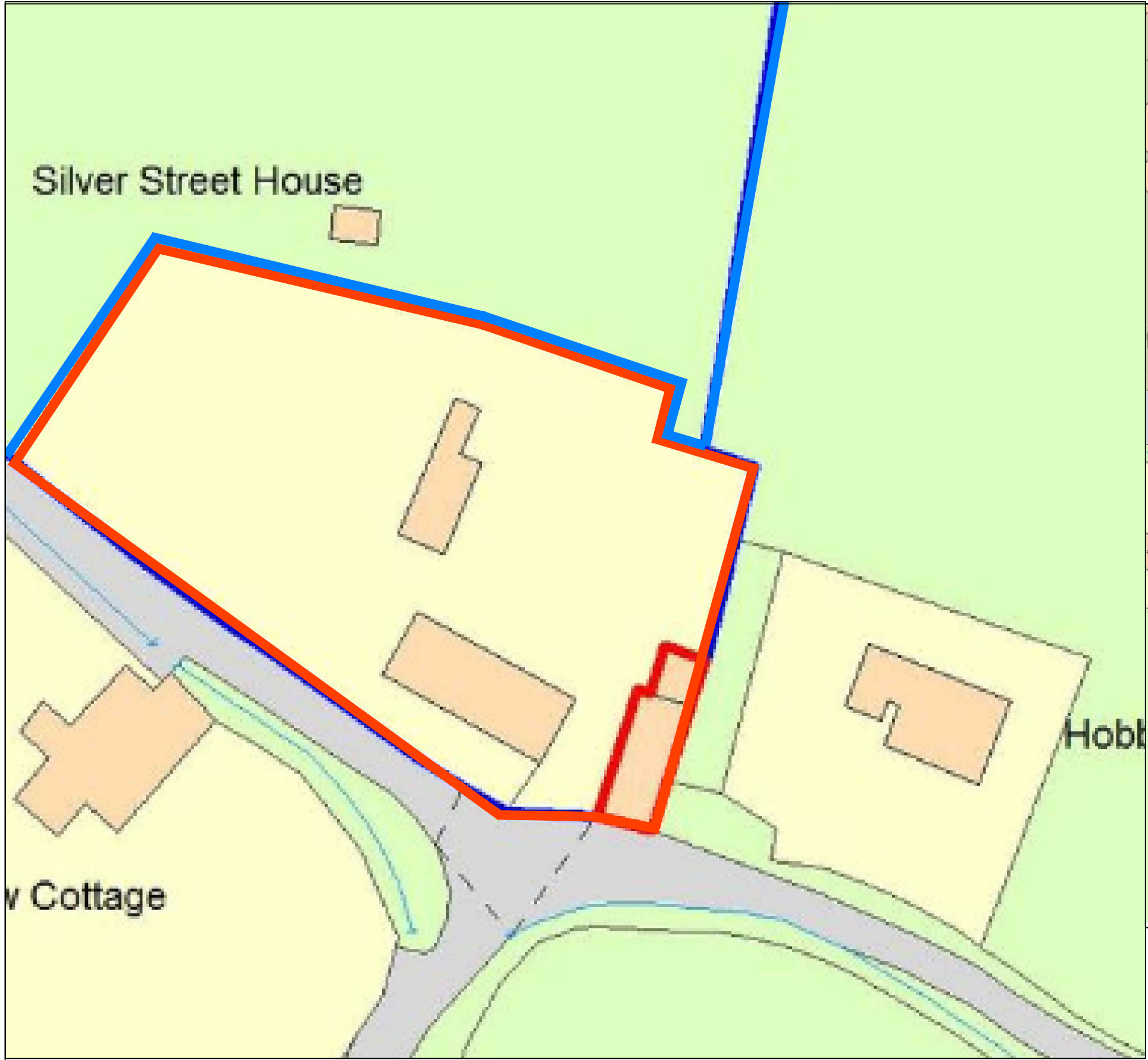
Block Plan Sc 1:200