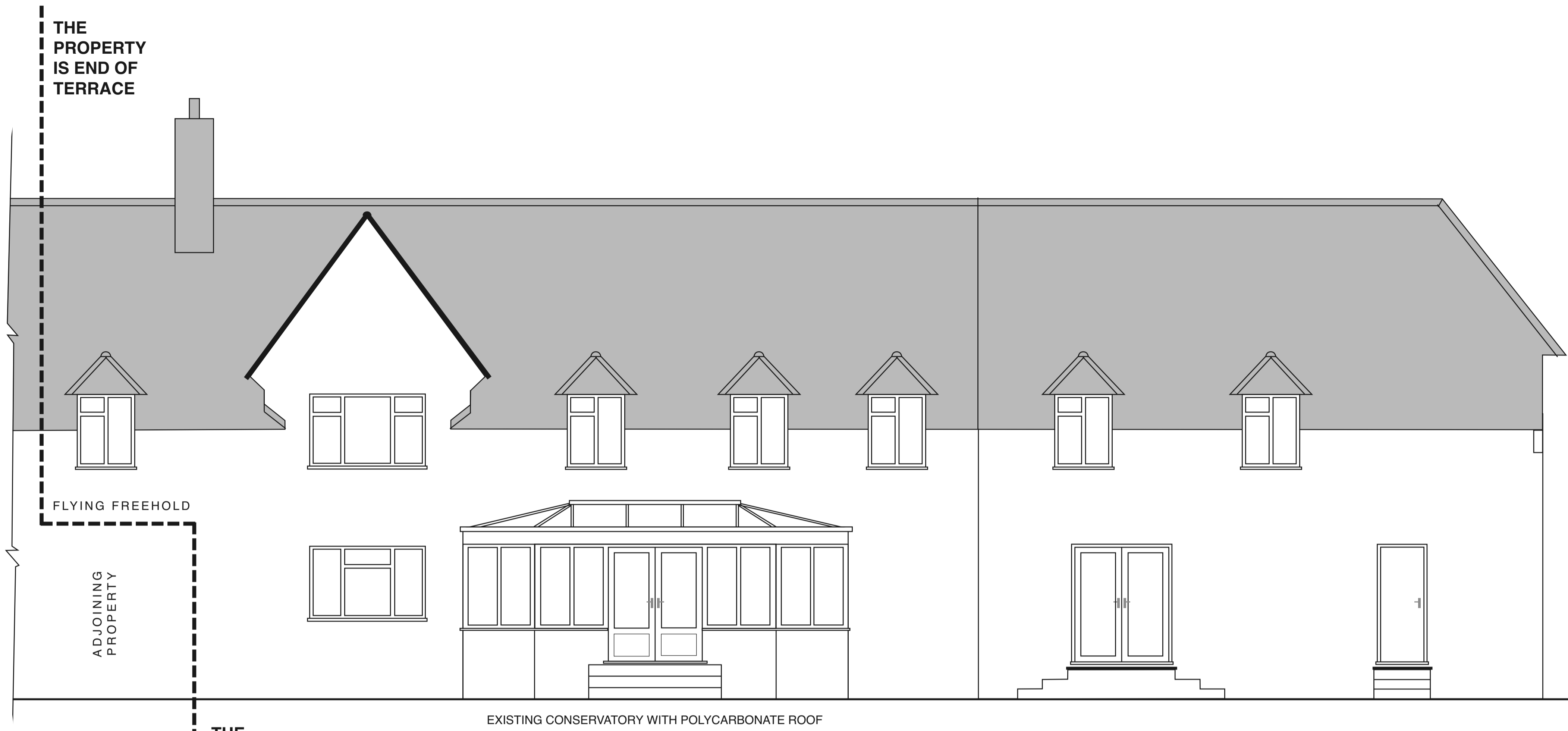
EXISTING CONSERVATORY WITH POLYCARBONATE ROOF