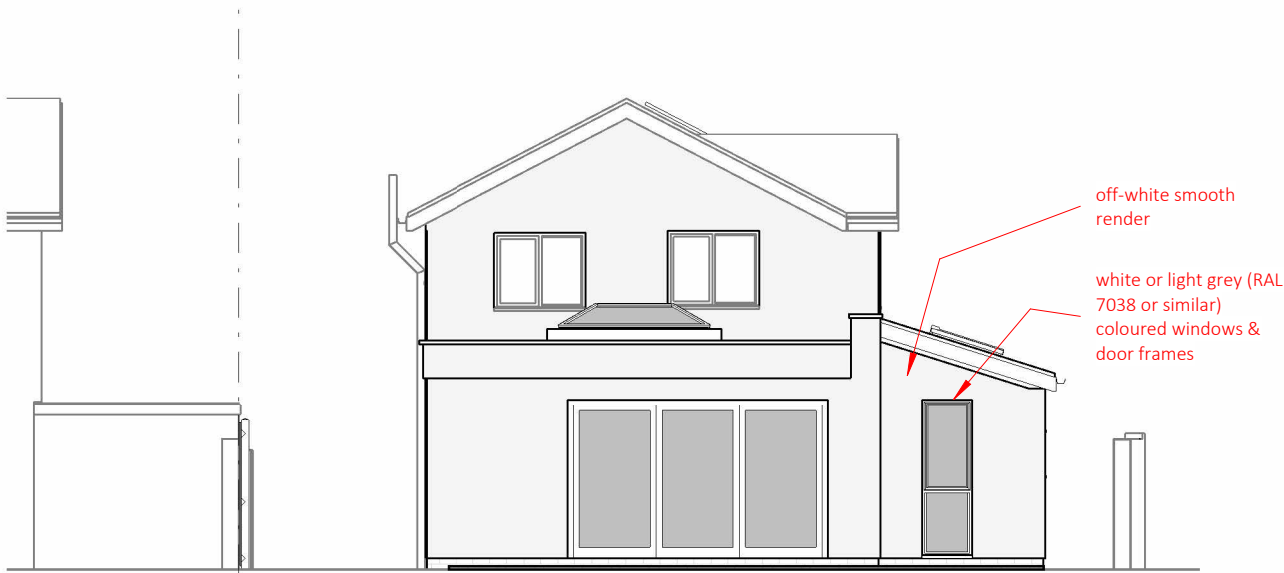
4 P08 south west elevation - proposed (house) 1 : 100

Existing House: All exposed existing external walls of existing house are to have external insulation (75mm maximum) with smooth off-white self coloured render to match proposed extension.