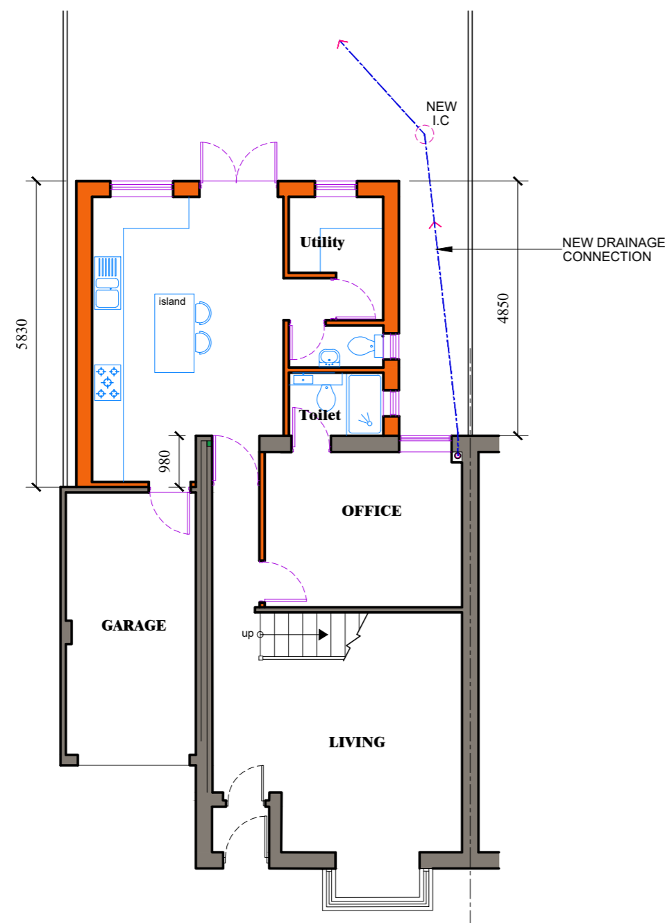
GROUND FLOOR PLAN SCALE 1:100

MATERIALS ROOF: ROOF TILES TO MATCH EXISTING WALL: BRICK FACING TO MATCH EXISTING / WINDOWS: UPVC 'A' RATED DOUBLE GLAZED WINDOWS TO MATCH EXISTING DOORS: UPVC 'A' RATED DOUBLE GLAZED DOORS TO MATCH EXISTING RAIN WATER UPVC GUTTER, RWP, FASCIA BOARD AND GOODS: SOFFIT BOARD