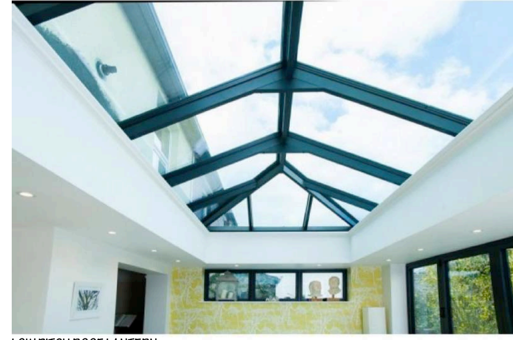
LOW PITCH ROOF LANTERN LUMINA DESIGN - Atlas 6mx3m Aluminium roof lantern [luminadesign.co.uk]