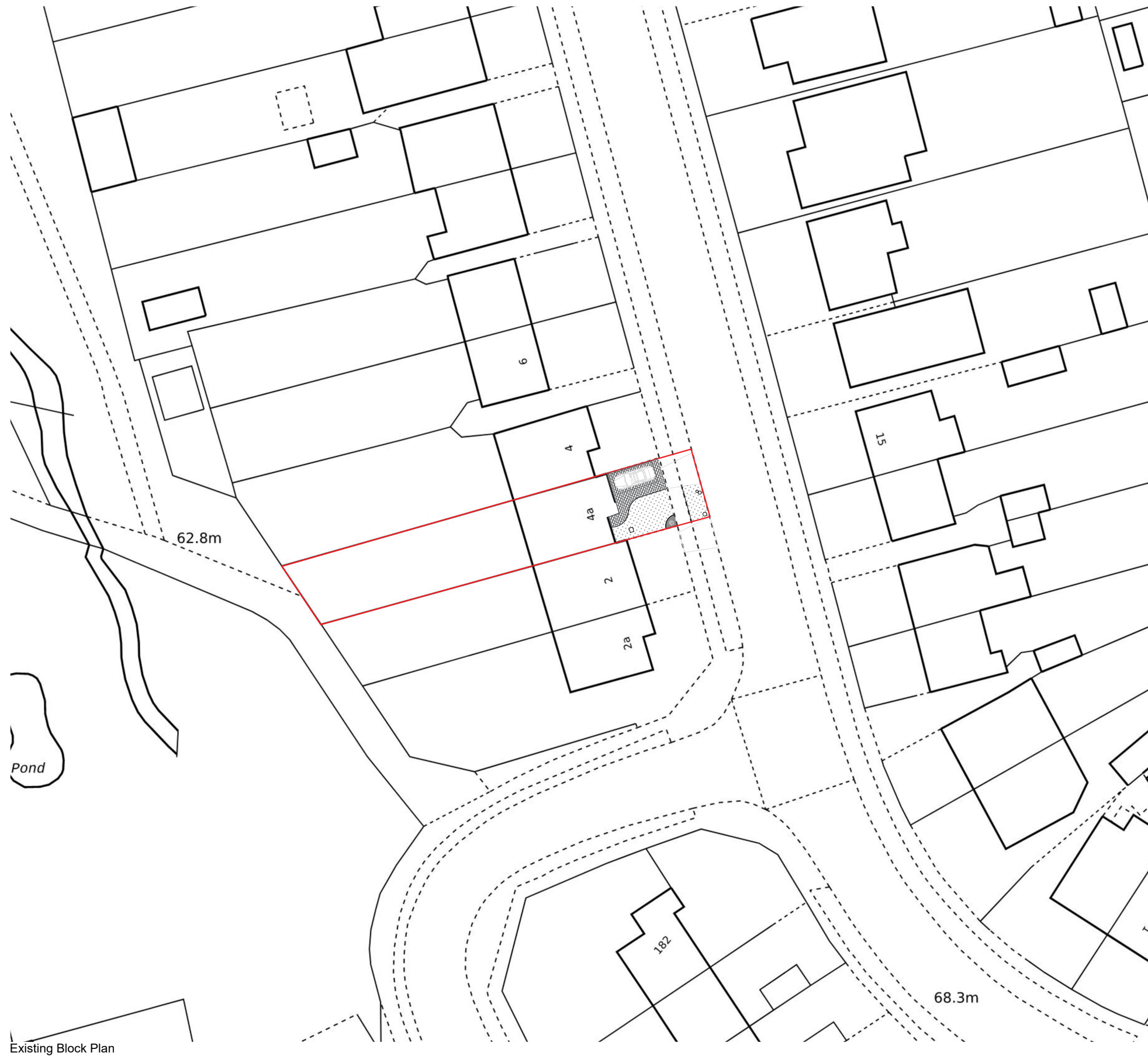
Existing Block Plan

Any dimensions shown should be checked on site and discrepancies reported to the Architect prior to construction. Designs are not coordinated with engineer projects. Do not scale for construction purposes.