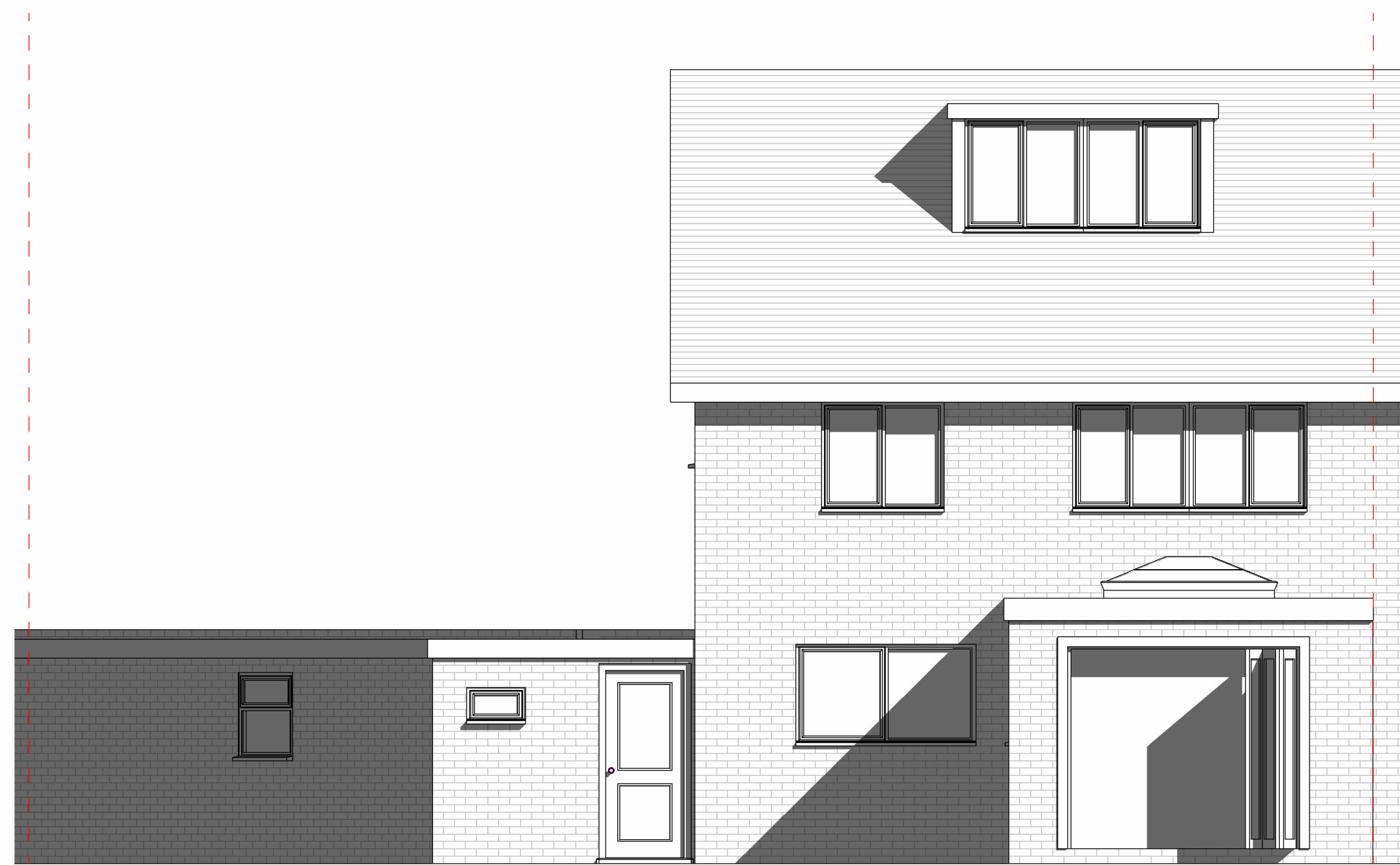
③ Existing Rear Elevation 1:50