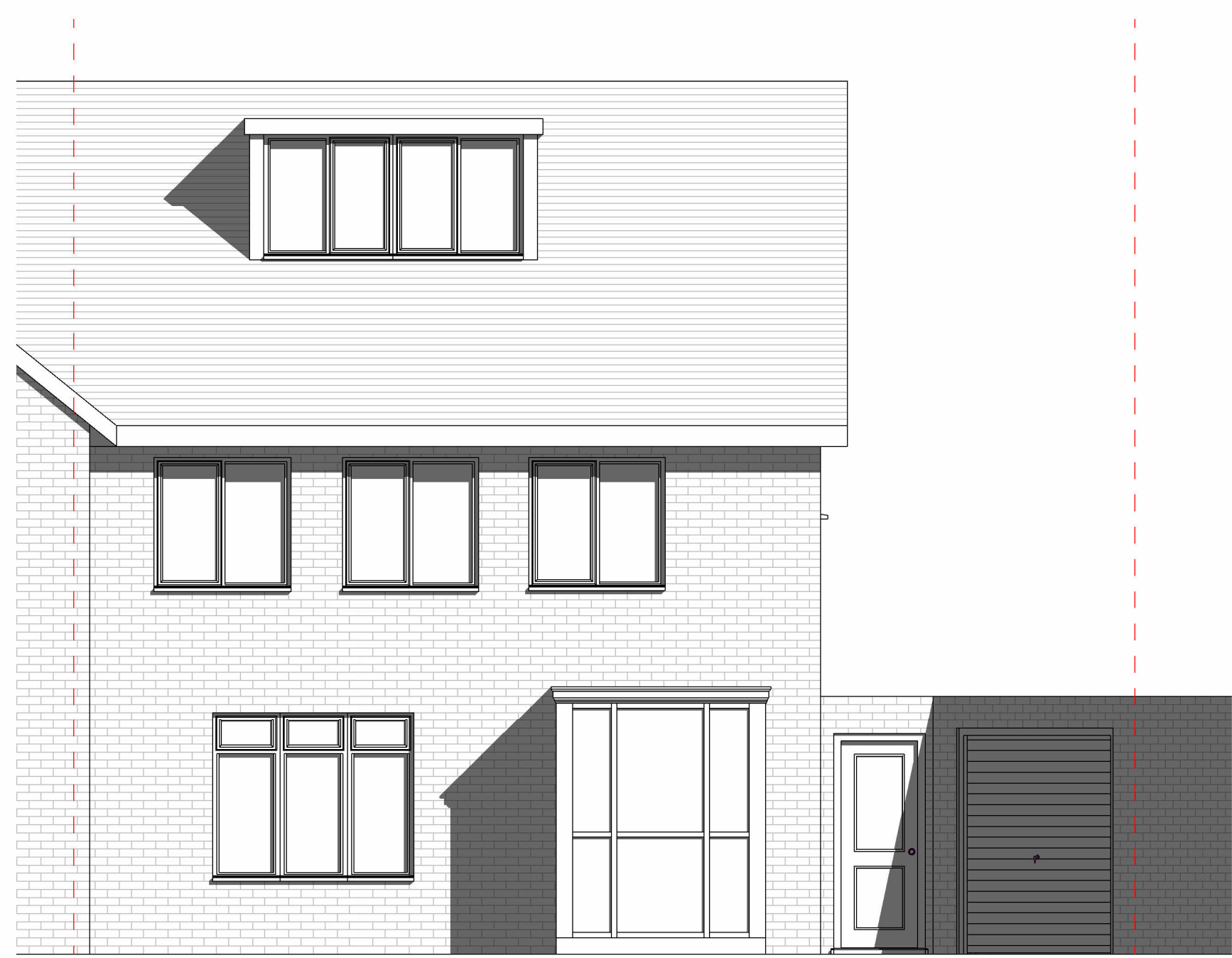
① Existing Front Elevation 1:50