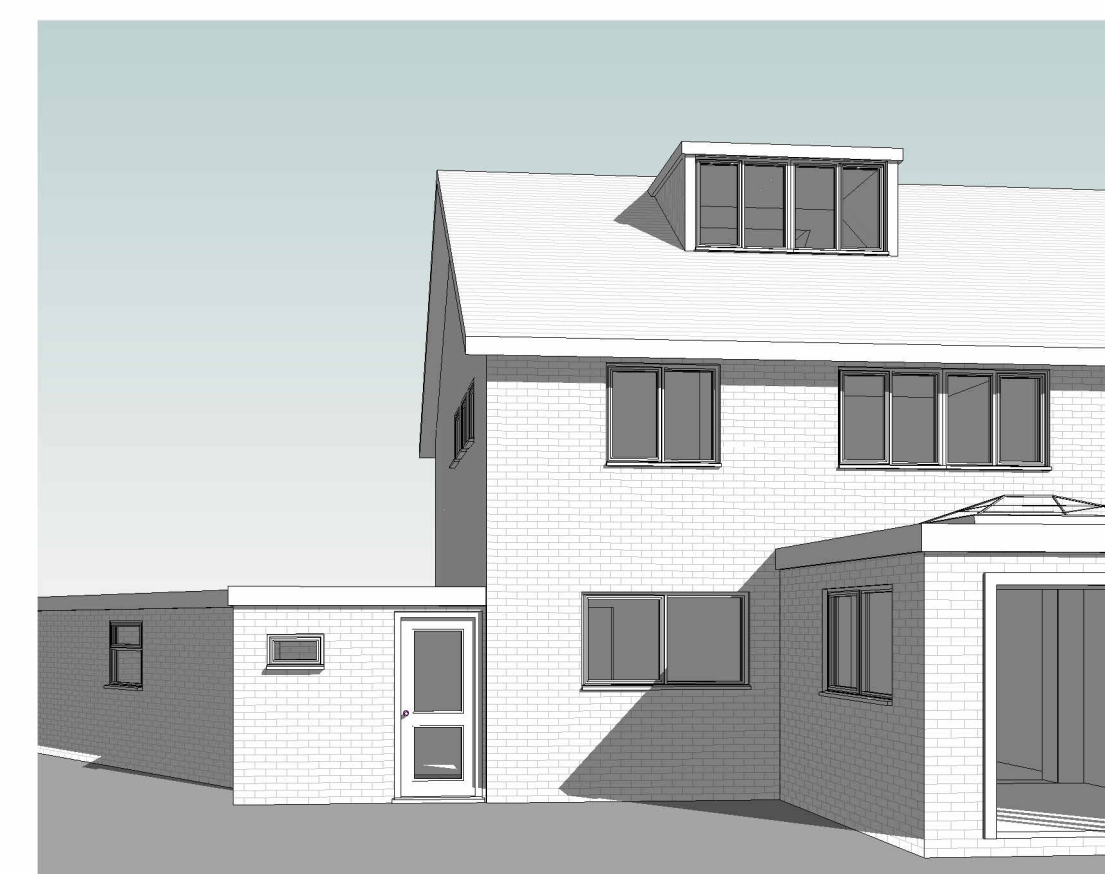
⑥ 3D View 2