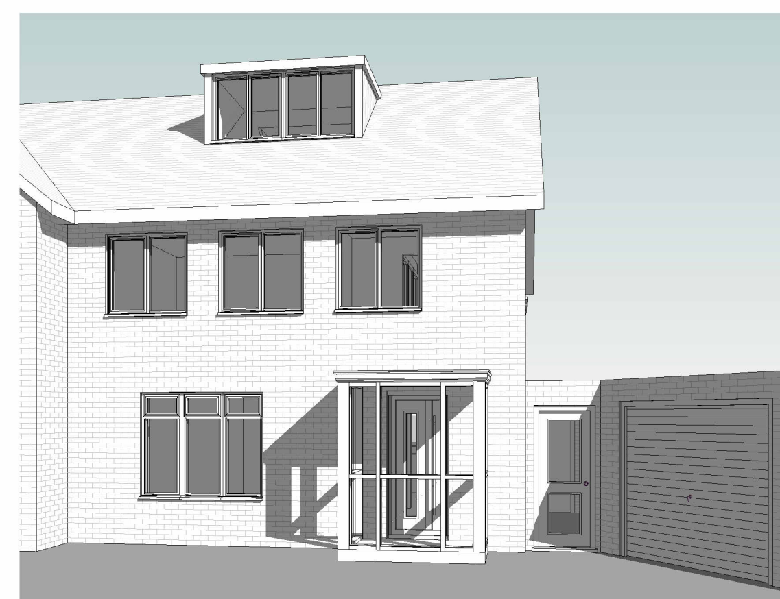
⑤ 3D View 1