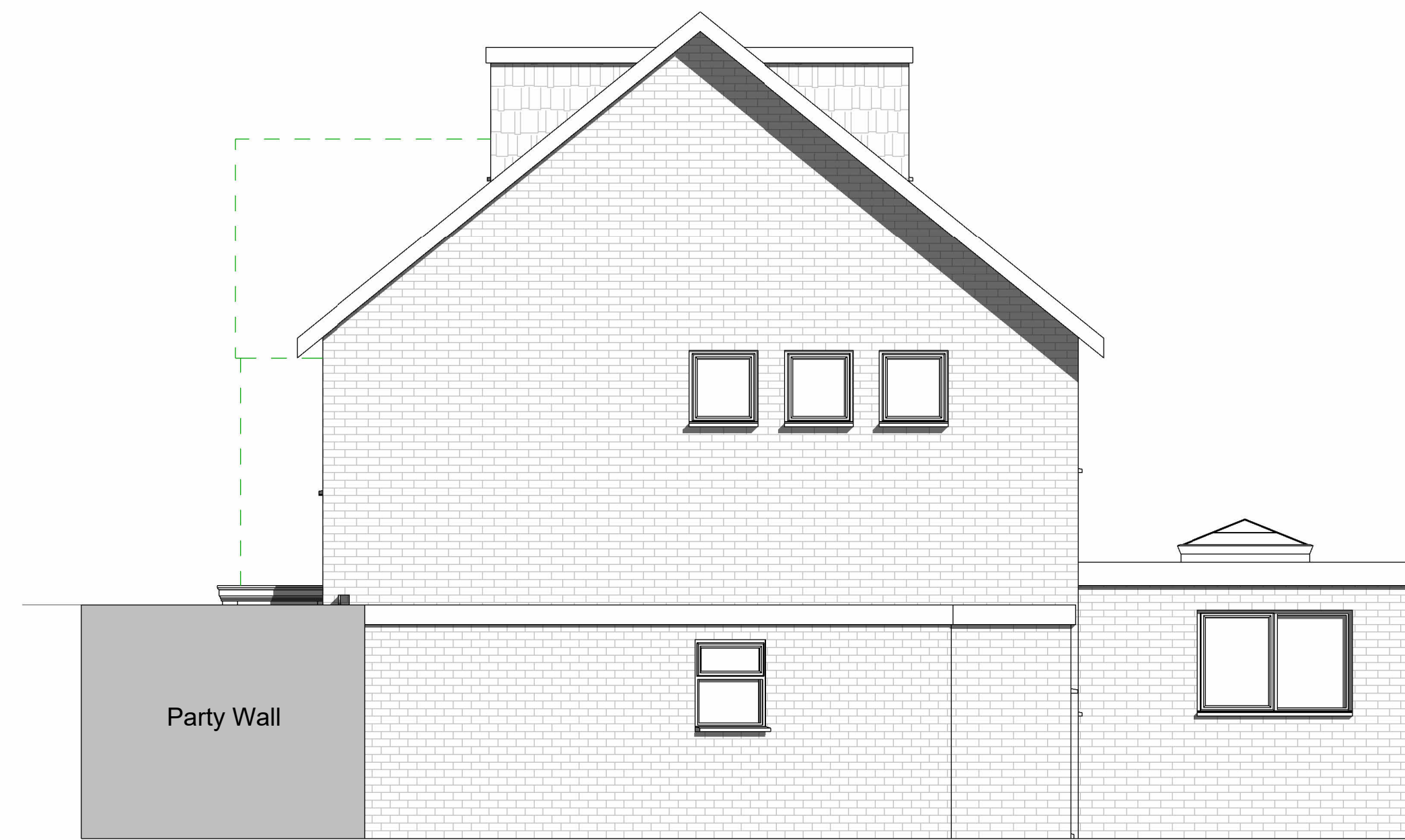
④ Existing Side Elevation_2 1:50