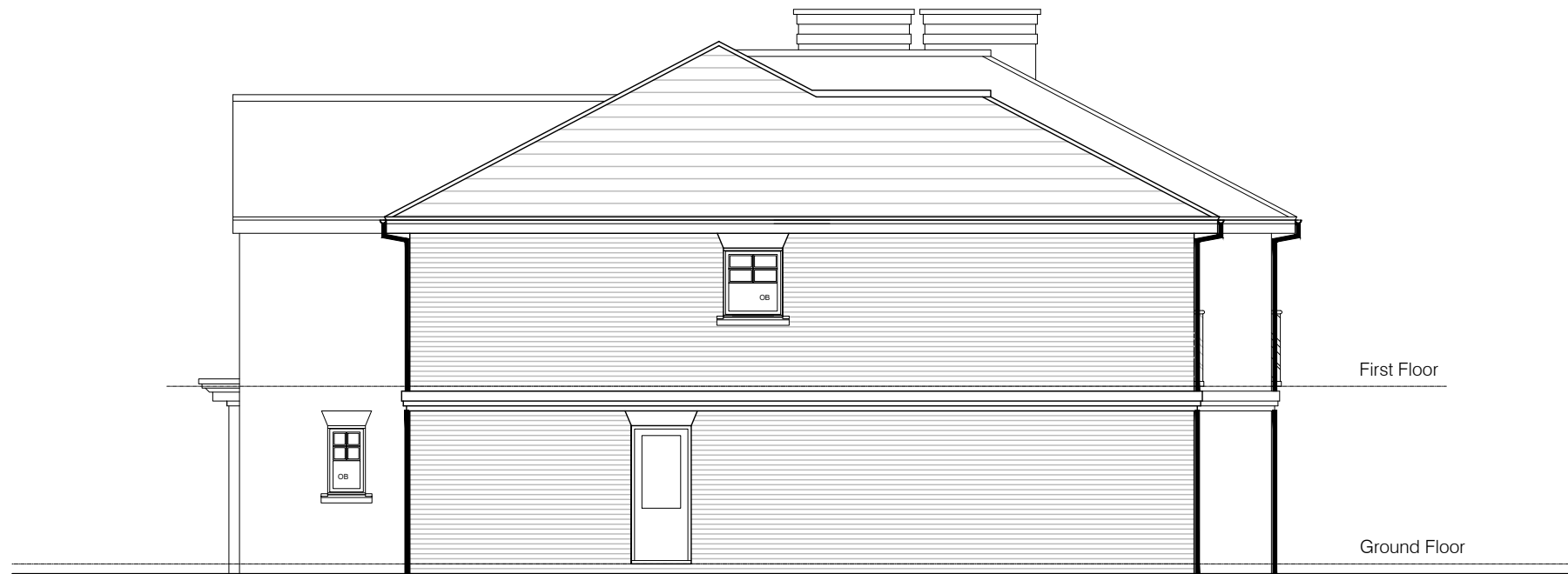
SIDE (NORTH) ELEVATION

All dimensions are in millimetres unless noted otherwise.