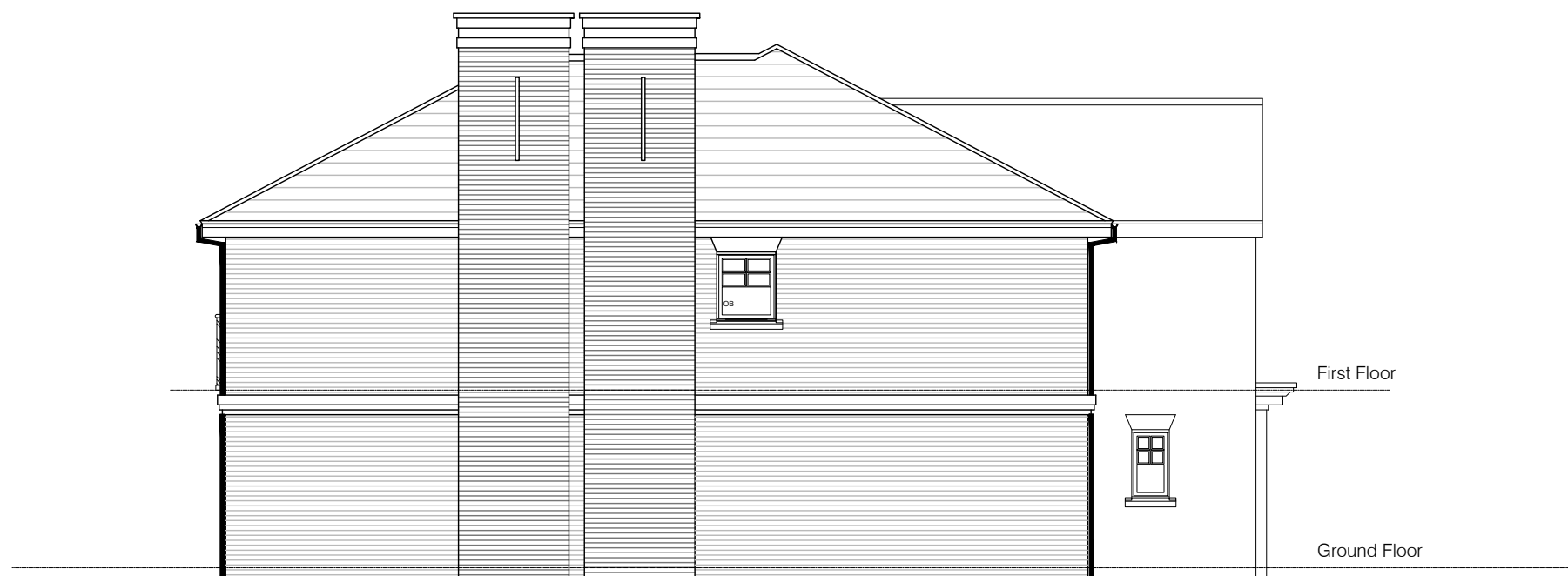
SIDE (SOUTH) ELEVATION