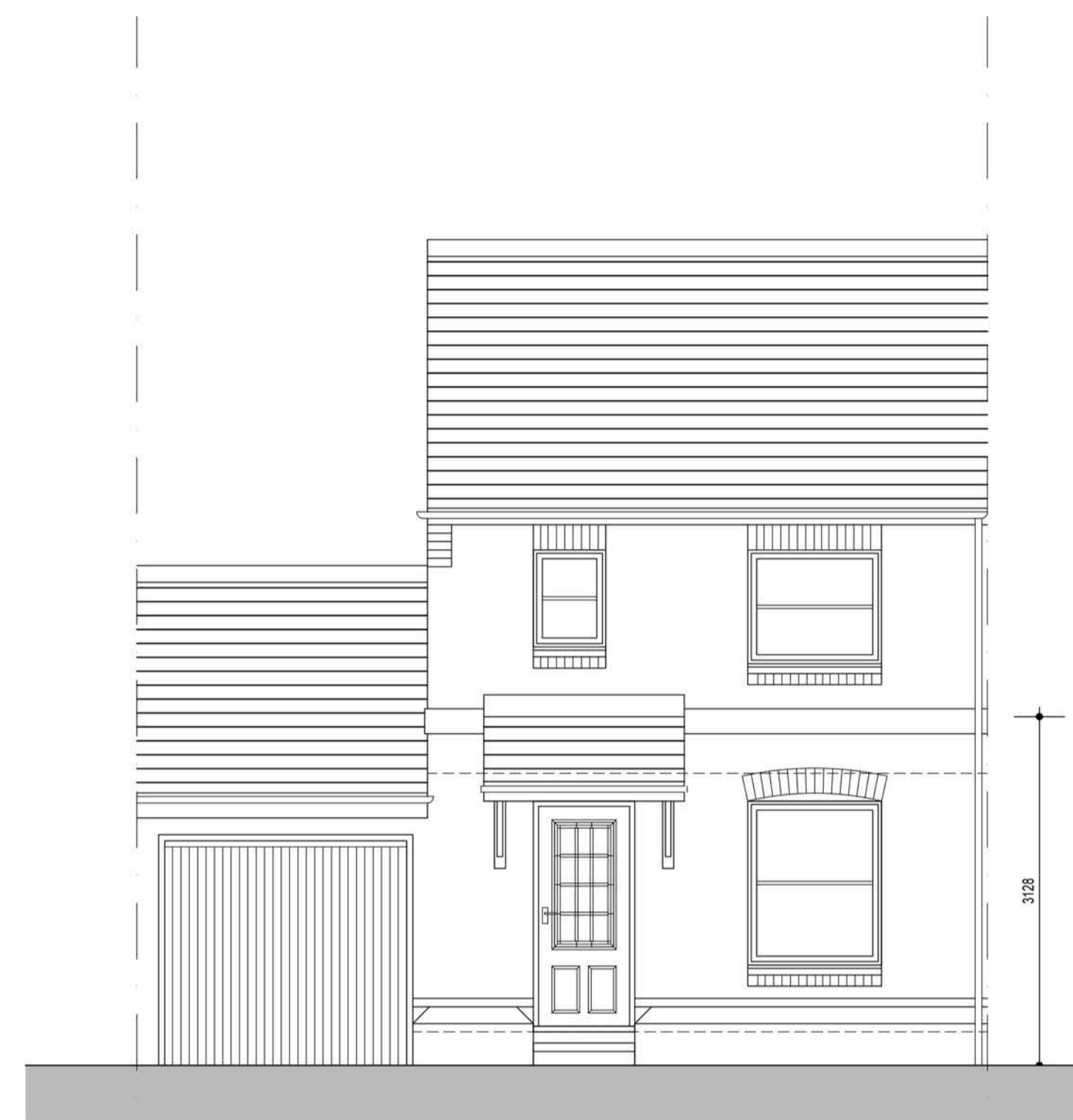
2 PROPOSED FRONT ELEVATION BRACKNELL, 2 SIMKINS CLOSE SCALE 1:50