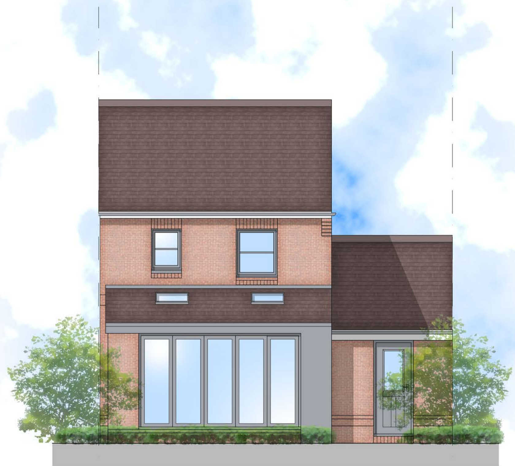
1 PROPOSED REAR ELEVATION BRACKNELL, 2 SIMKINS CLOSE SCALE 1:50