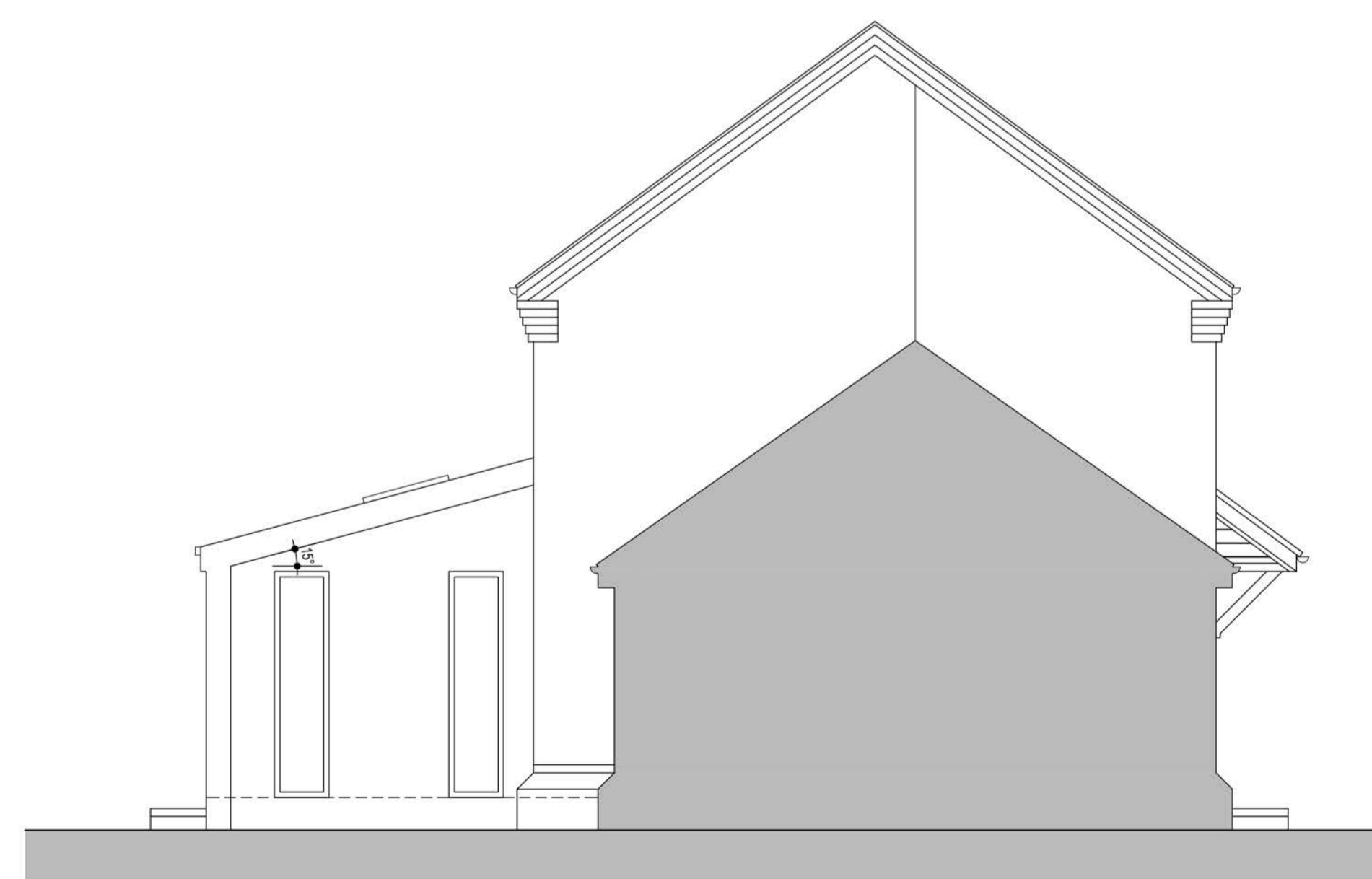
4 PROPOSED ELEVATION & SECTION BRACKNELL, 2 SIMKINS CLOSE SCALE 1:50