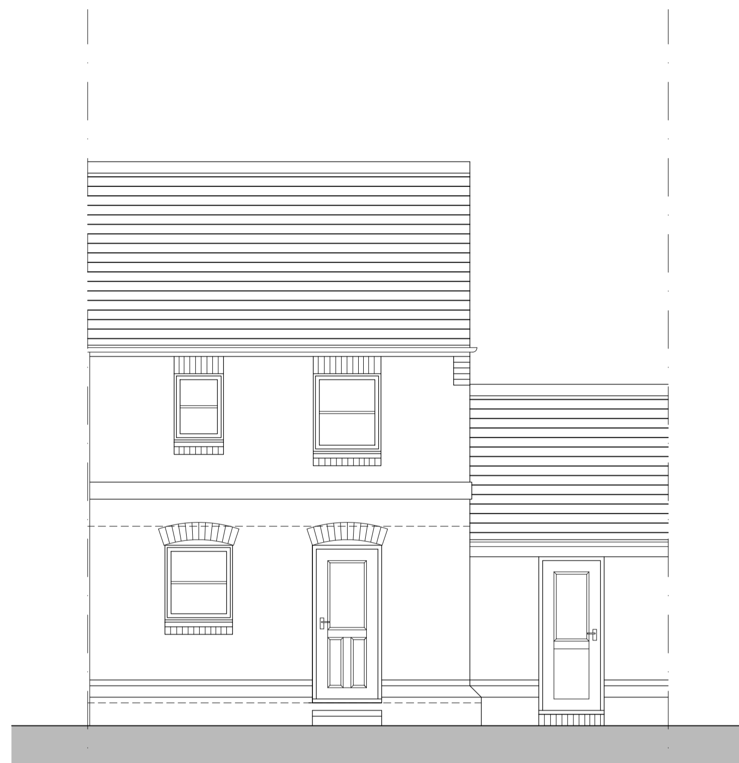
1 EXISTING REAR ELEVATION BRACKNELL, 2 SIMKINS CLOSE SCALE 1:50