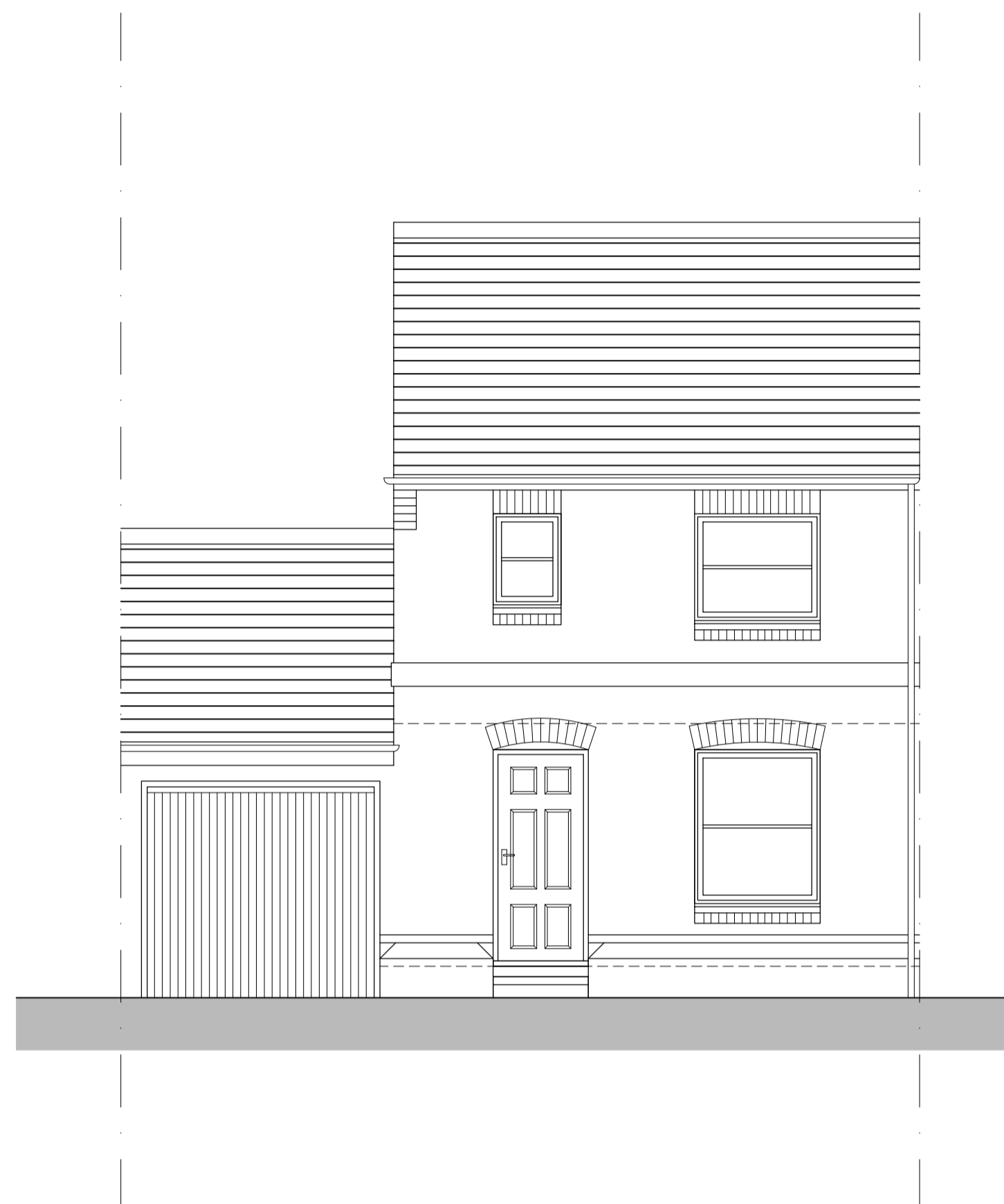
2 EXISTING FRONT ELEVATION BRACKNELL, 2 SIMKINS CLOSE SCALE 1:50