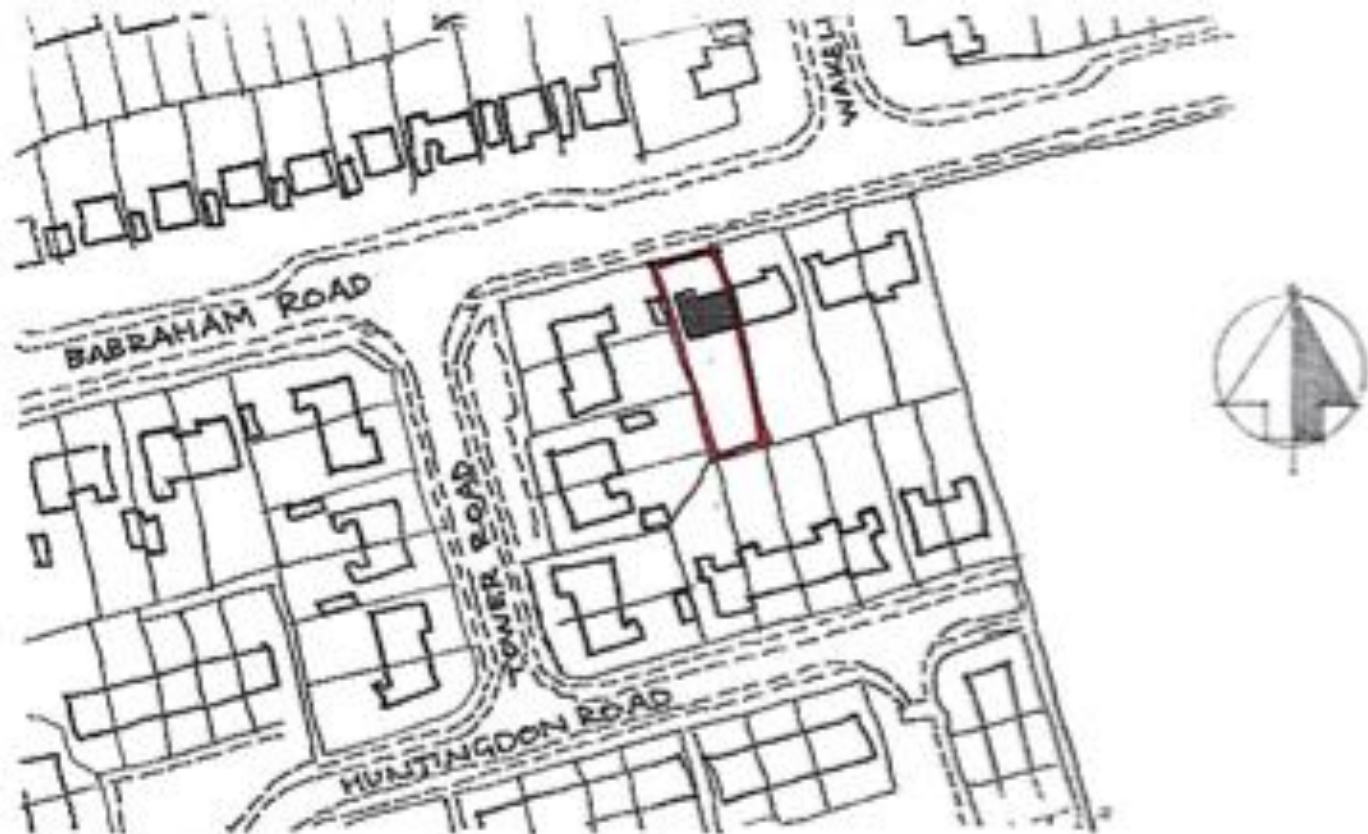
LOCATION PLAN. 1:1250