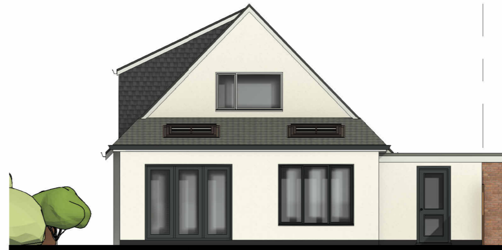
PROPOSED REAR (SW) 1 : 100