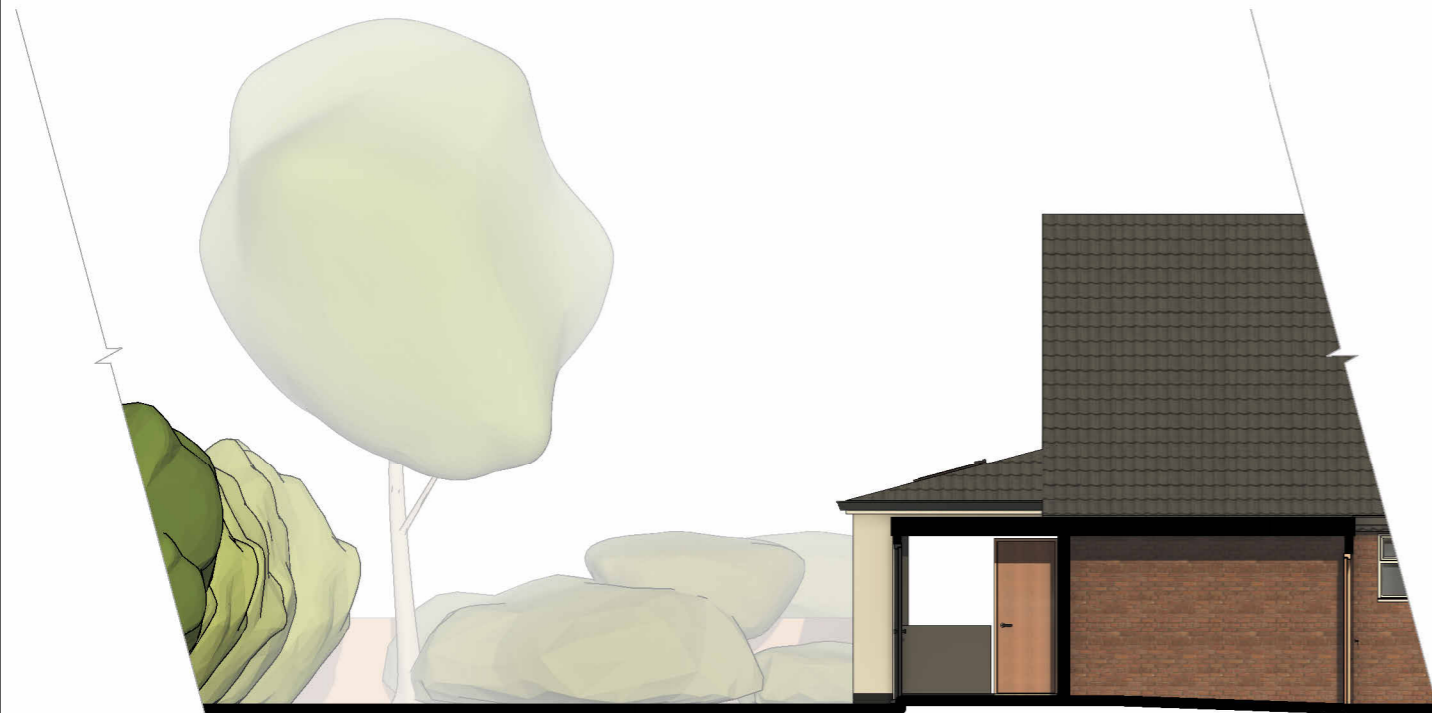
PROPOSED SIDE (SE) 1 : 100