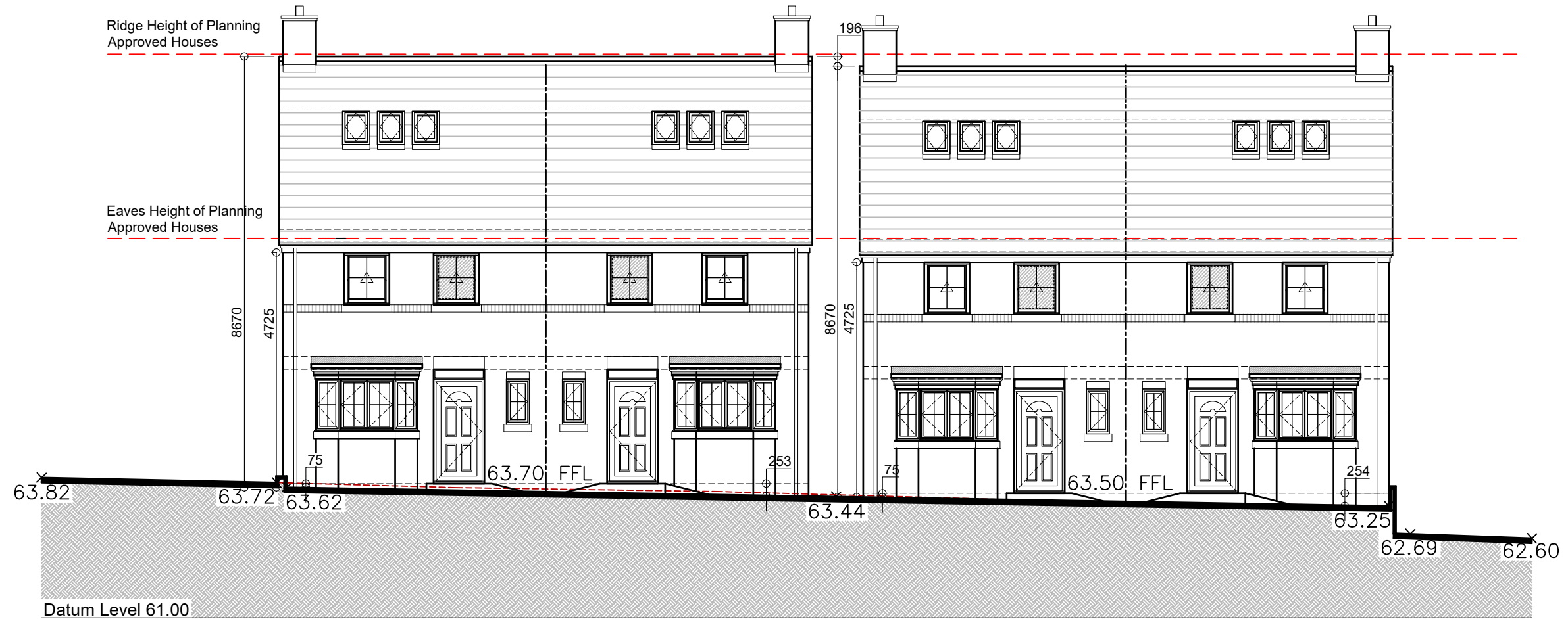
Proposed Street Scene Scale 1:100

PLANNING ISSUE PLEASE NOTE THESE DRAWINGS ARE FOR THE PURPOSE OF PLANNING ONLY THESE ARE NOT CONSTRUCTION DRAWINGS