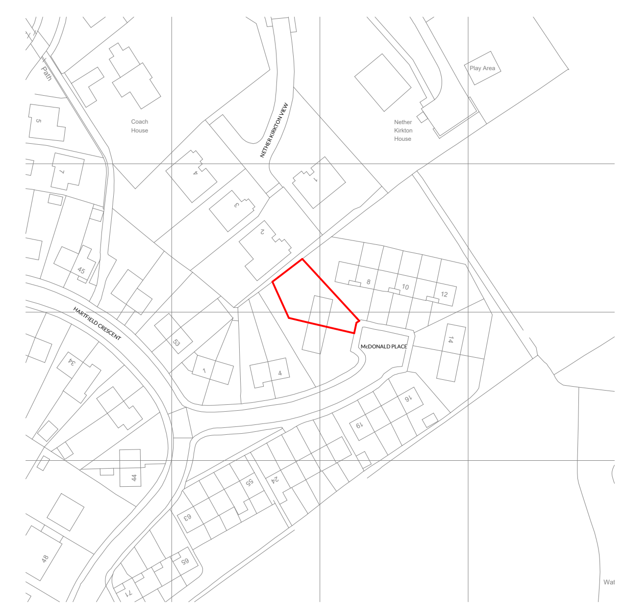
3 LOCATION PLAN - AS EXISTING 1:1250