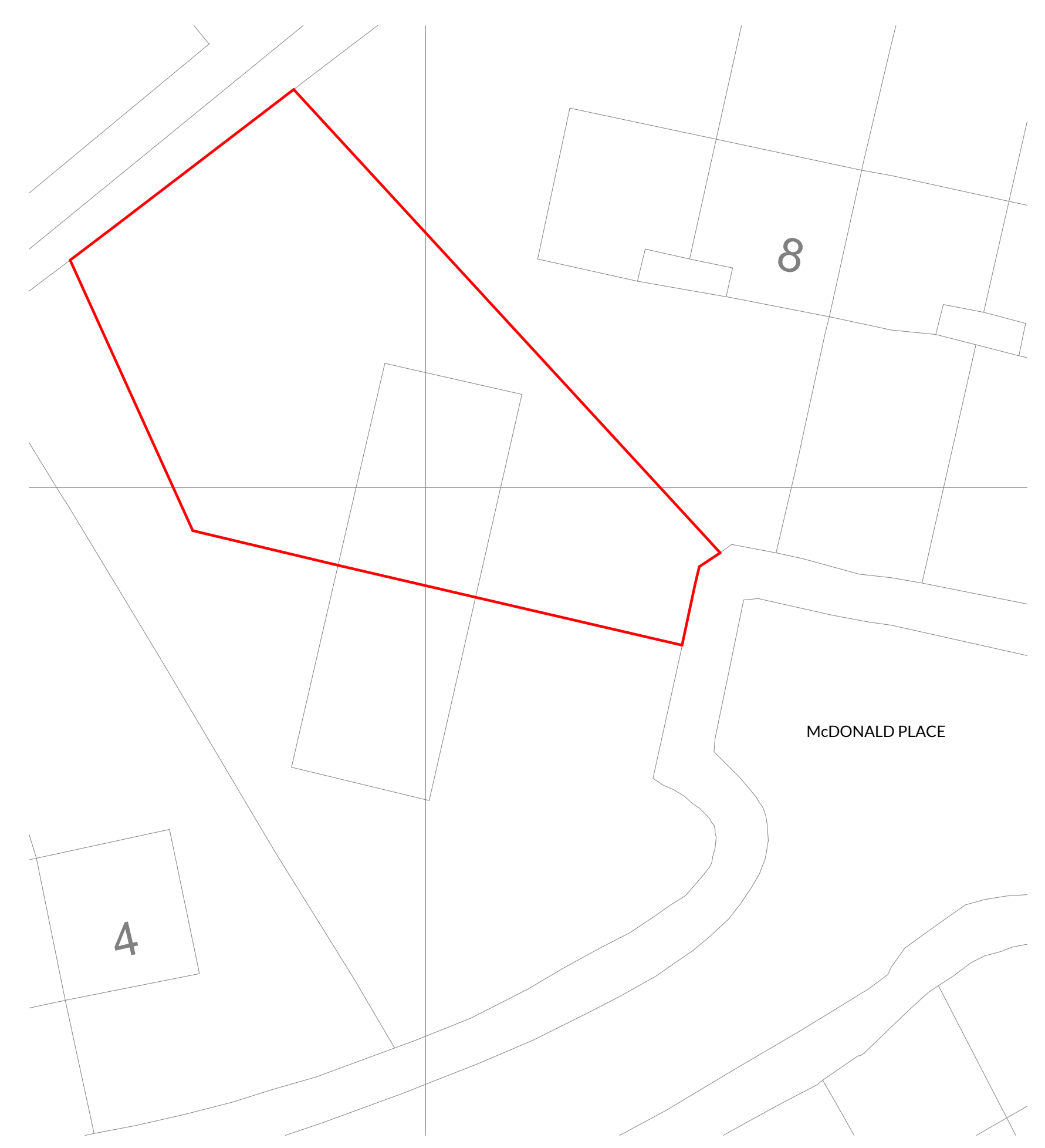
1 SITE PLAN - AS EXISTING 1:200