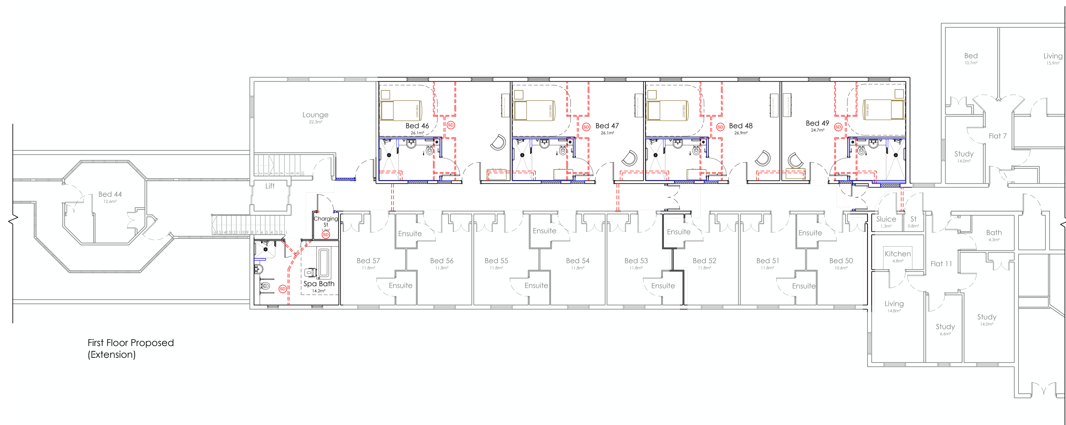
First Floor Proposed (Extension)

Notes Do not scale, use figured dimensions only. All dimensions to be verified on site prior to the commencement of any work or the production of any shop drawing. All discrepancies to be reported to the Architect. This drawing is to be read in conjunction with all related Architect's and Engineer's drawings and any other relevant information. This drawing is copyright © of TDC Architects Ltd.