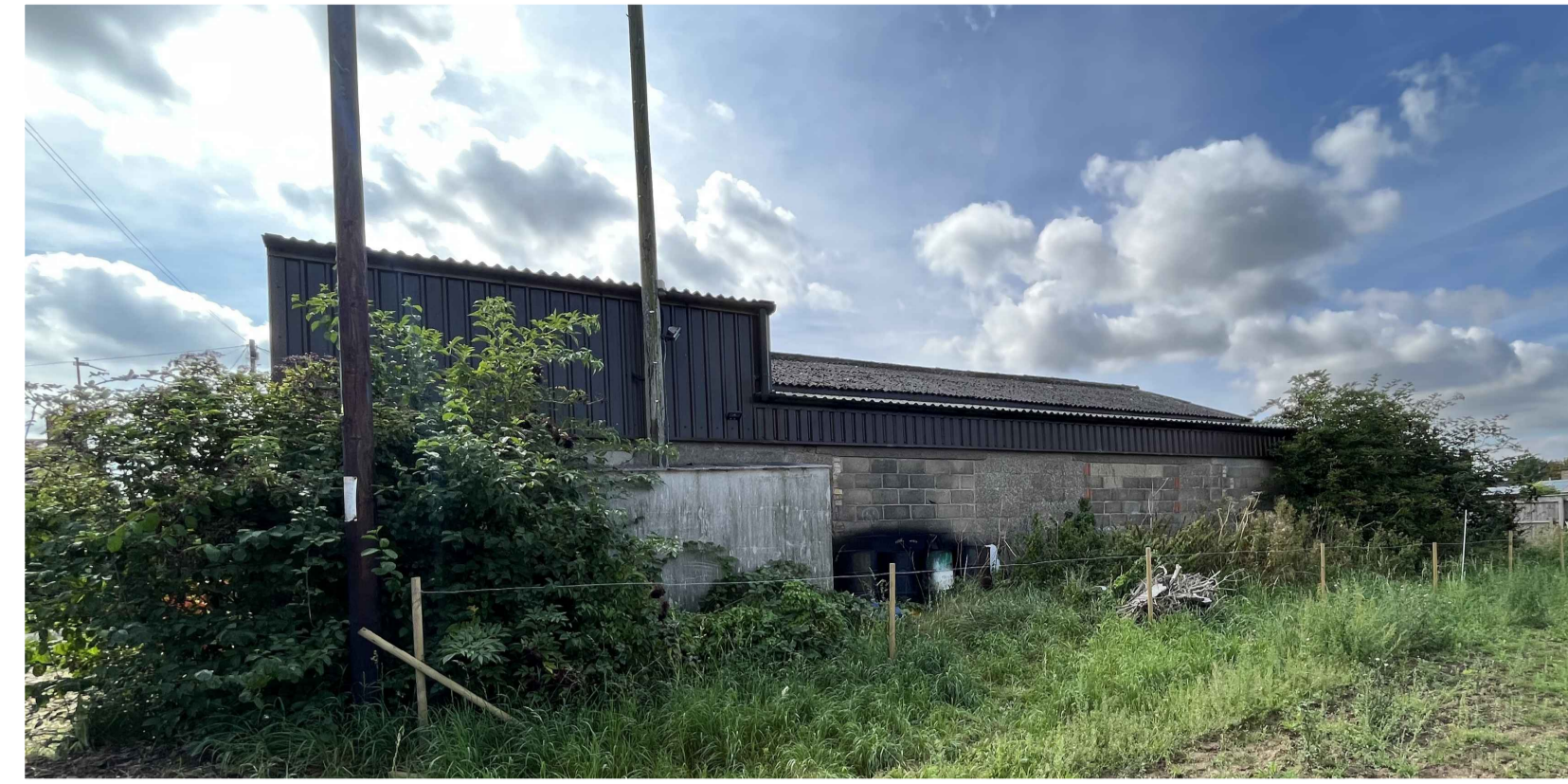
IMAGE OF REAR ELEVATION OF EXISTING DEPOT BUILDING NTS