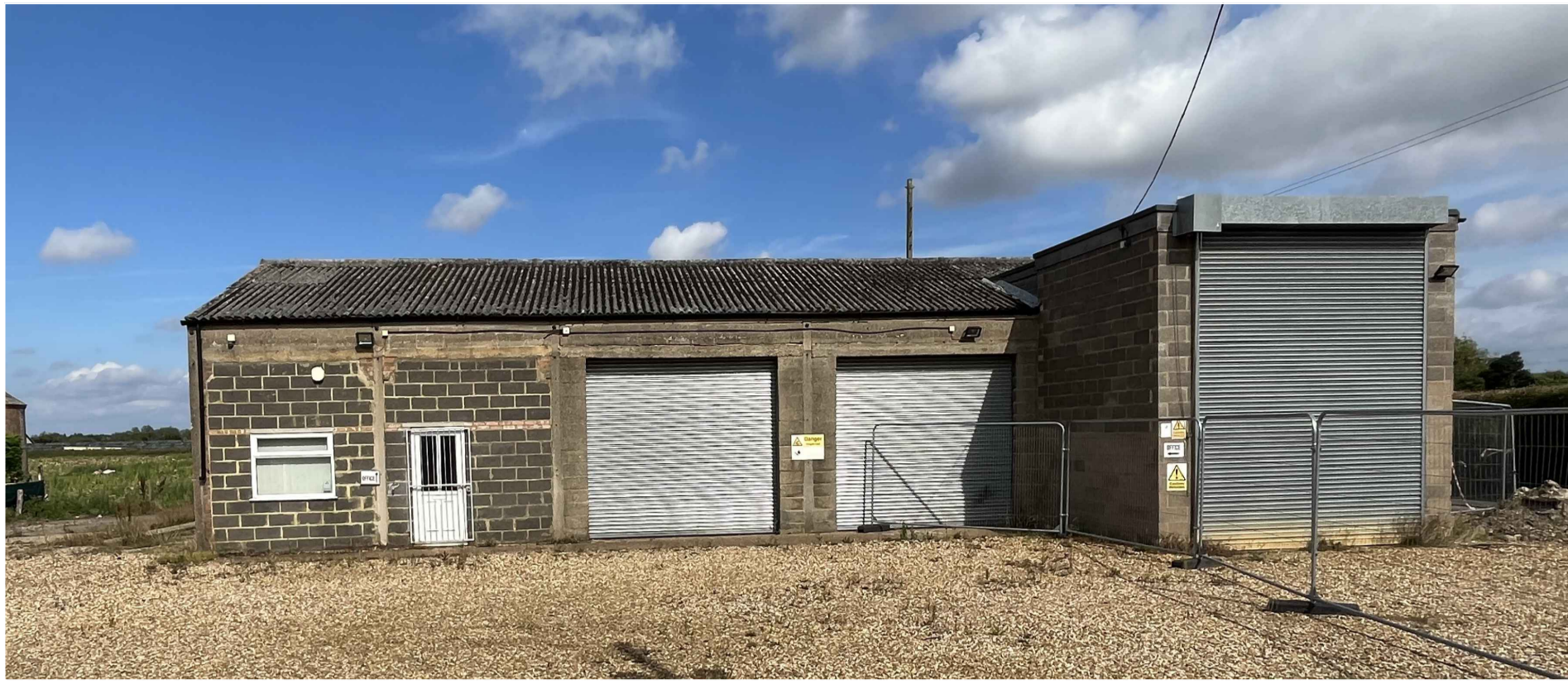
IMAGE OF FRONT ELEVATION OF EXISTING DEPOT BUILDING NTS