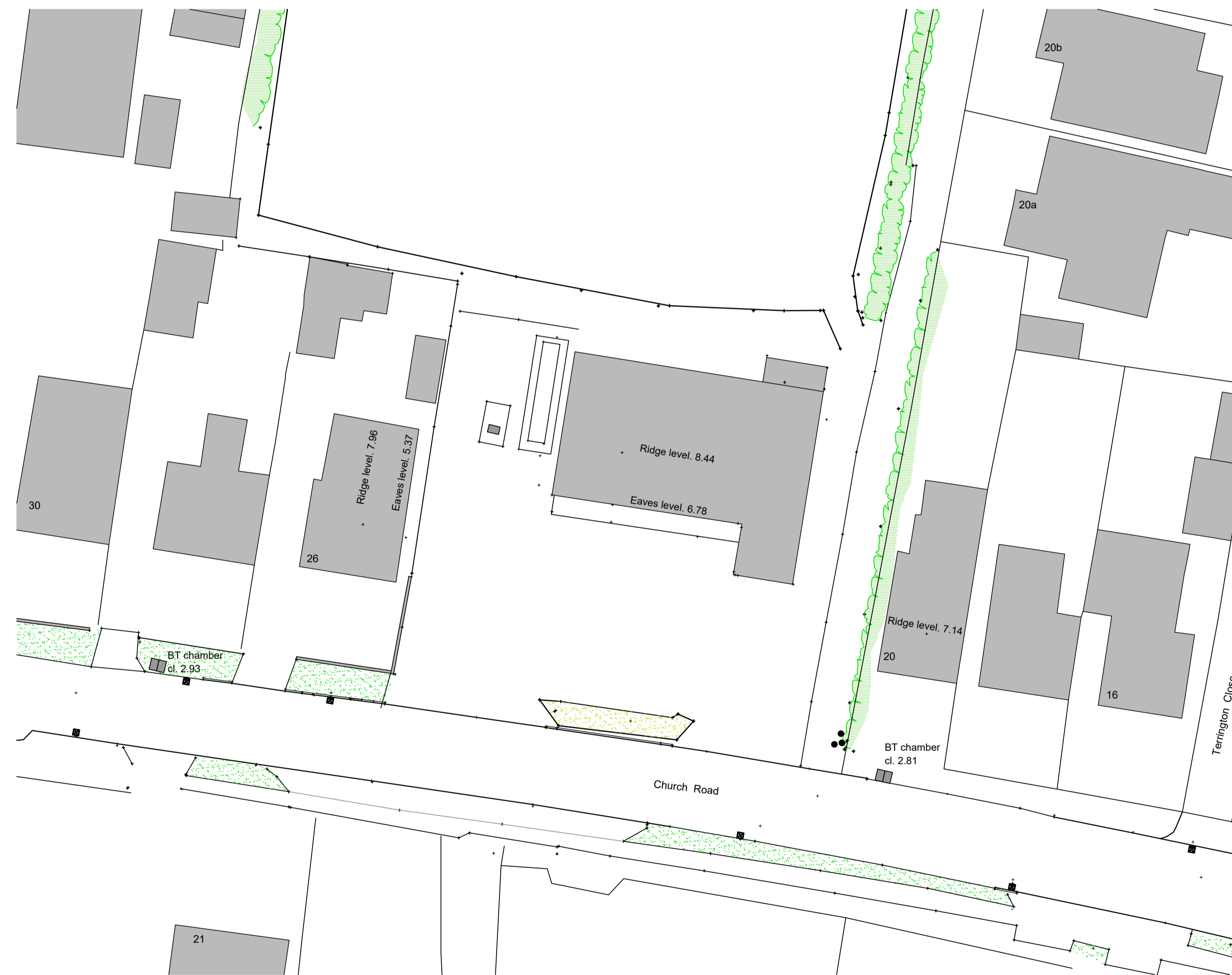
EXISTING SITE PLAN 1:250