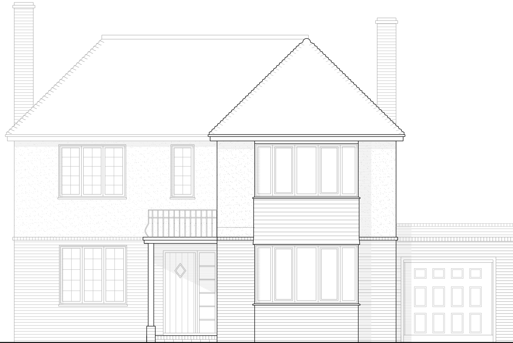
Proposed South West Elevation Scale 1:50