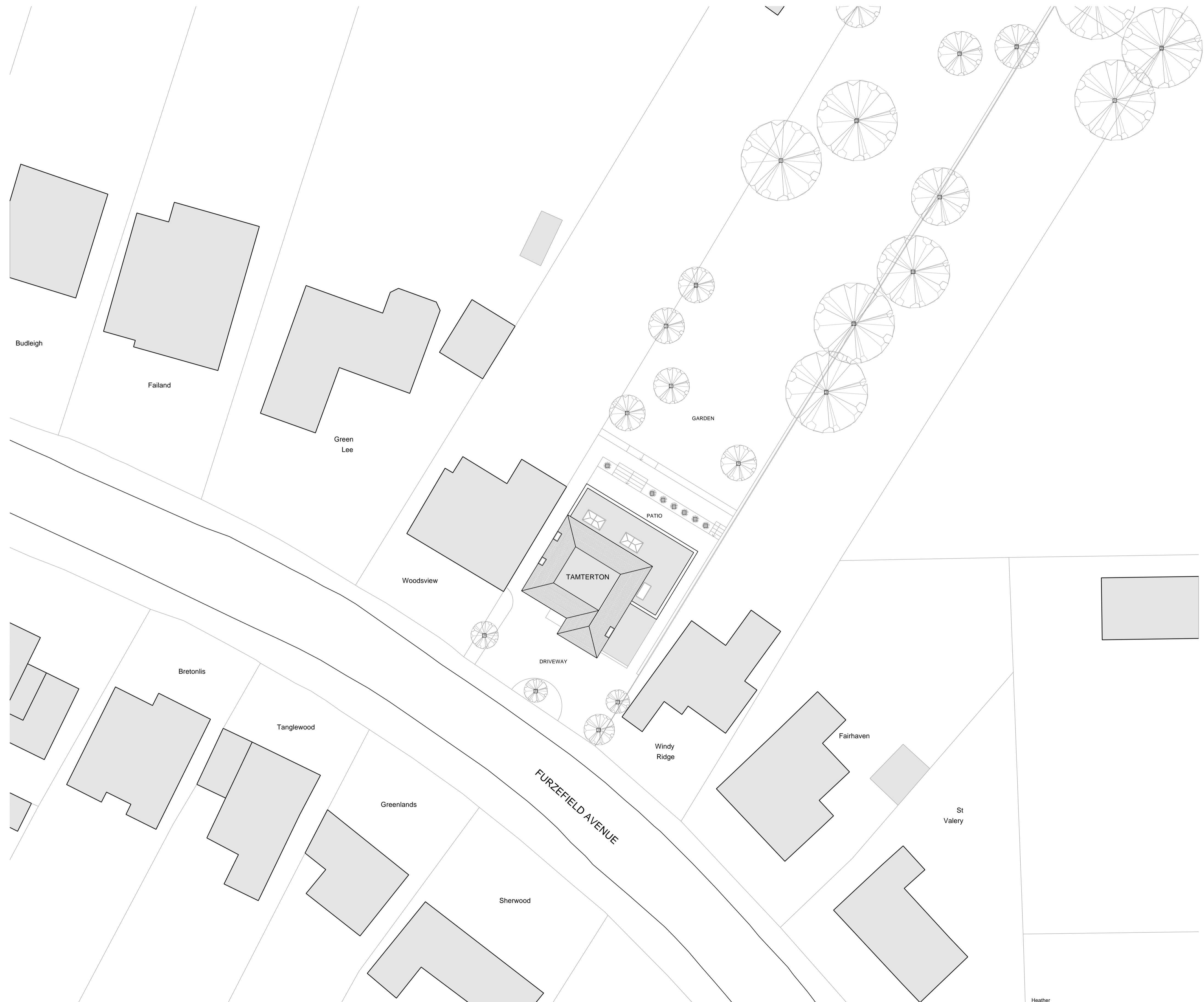
Proposed Block Plan Scale 1:200