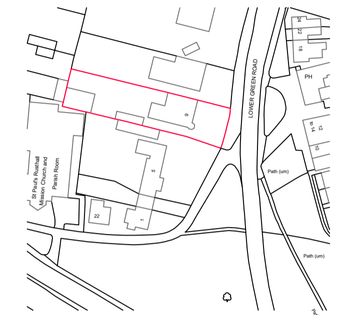
03 Site Location Plan Scale 1:1250