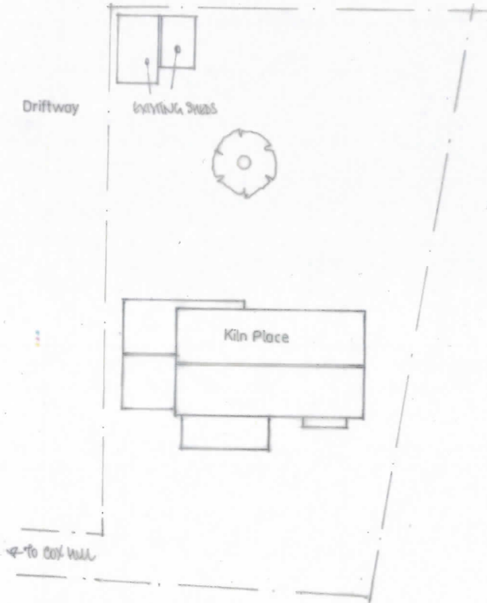
EXISTING SITE PLAN 1:200