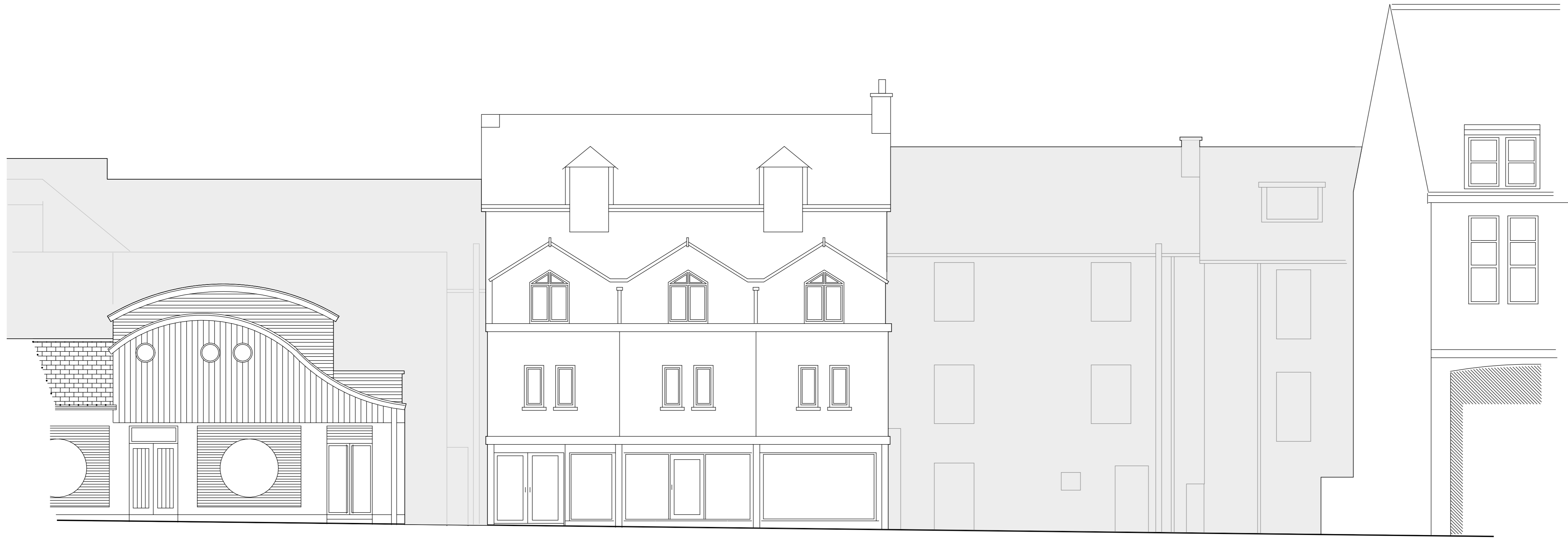
North West Elevation Street Scene