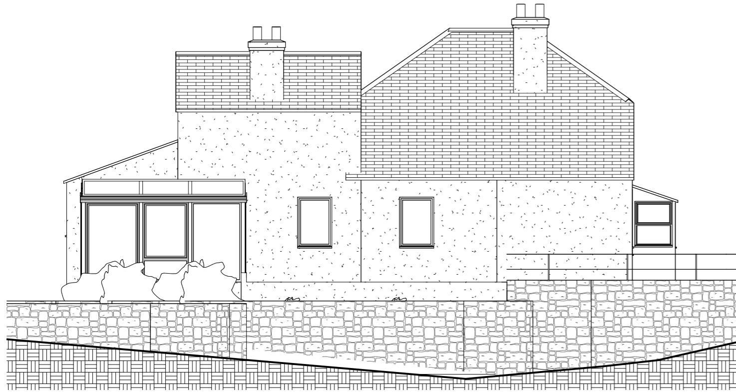
Existing South Elevation 1 : 100