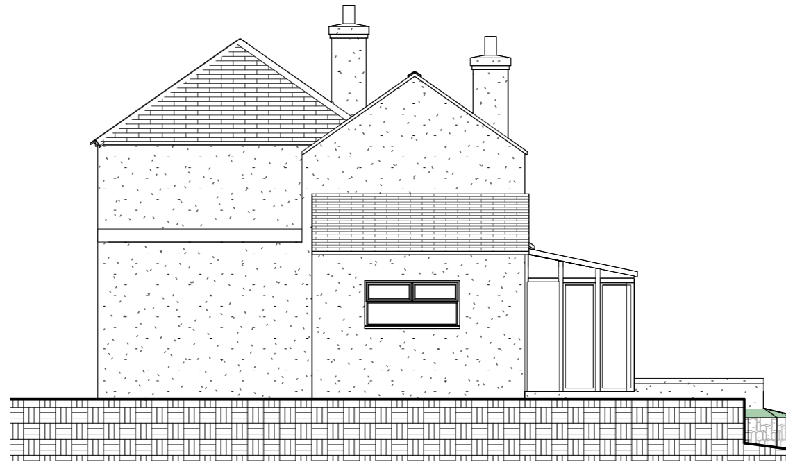
Existing West Elevation 1 : 100