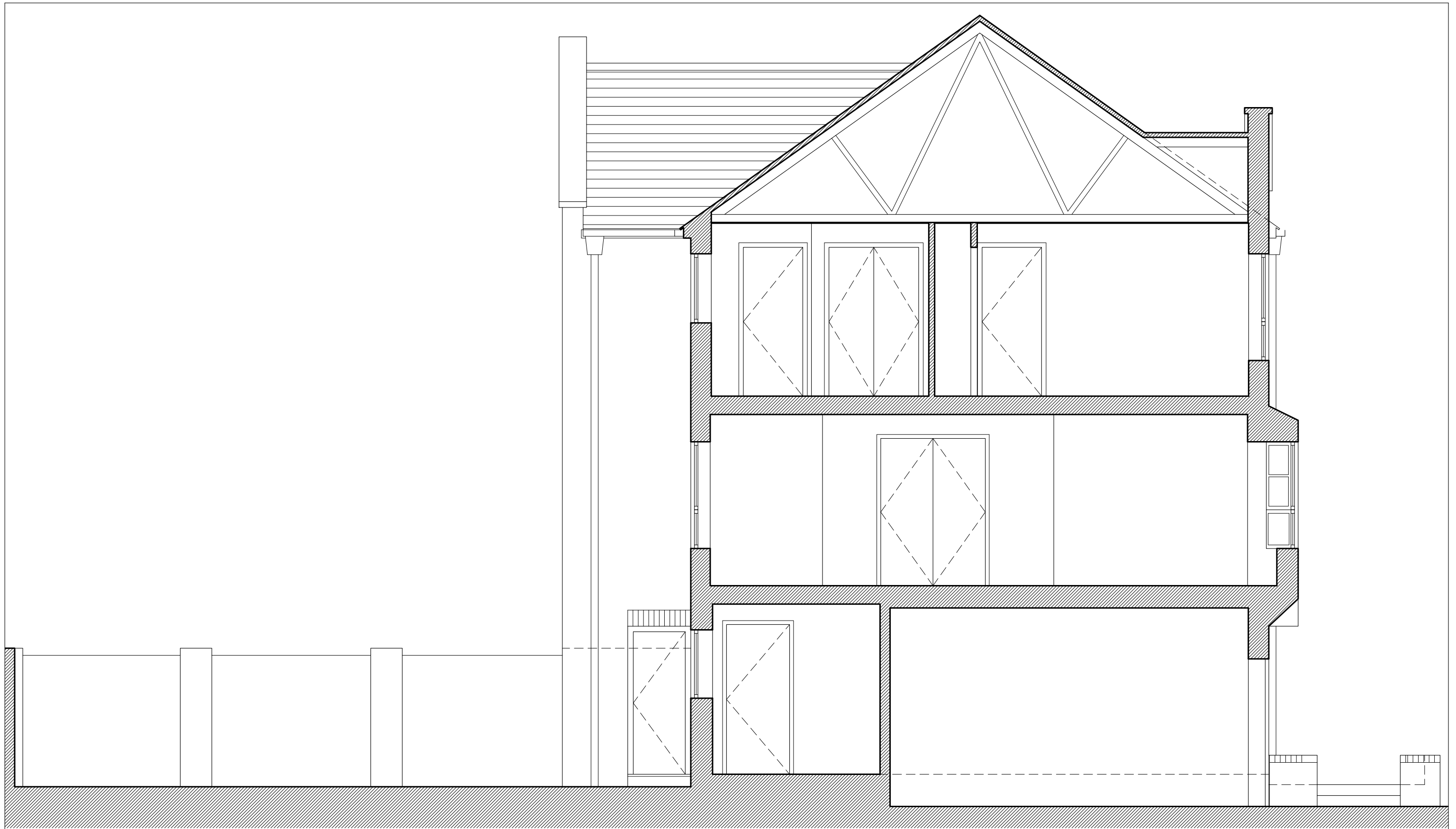
EXISTING SECTION A-A