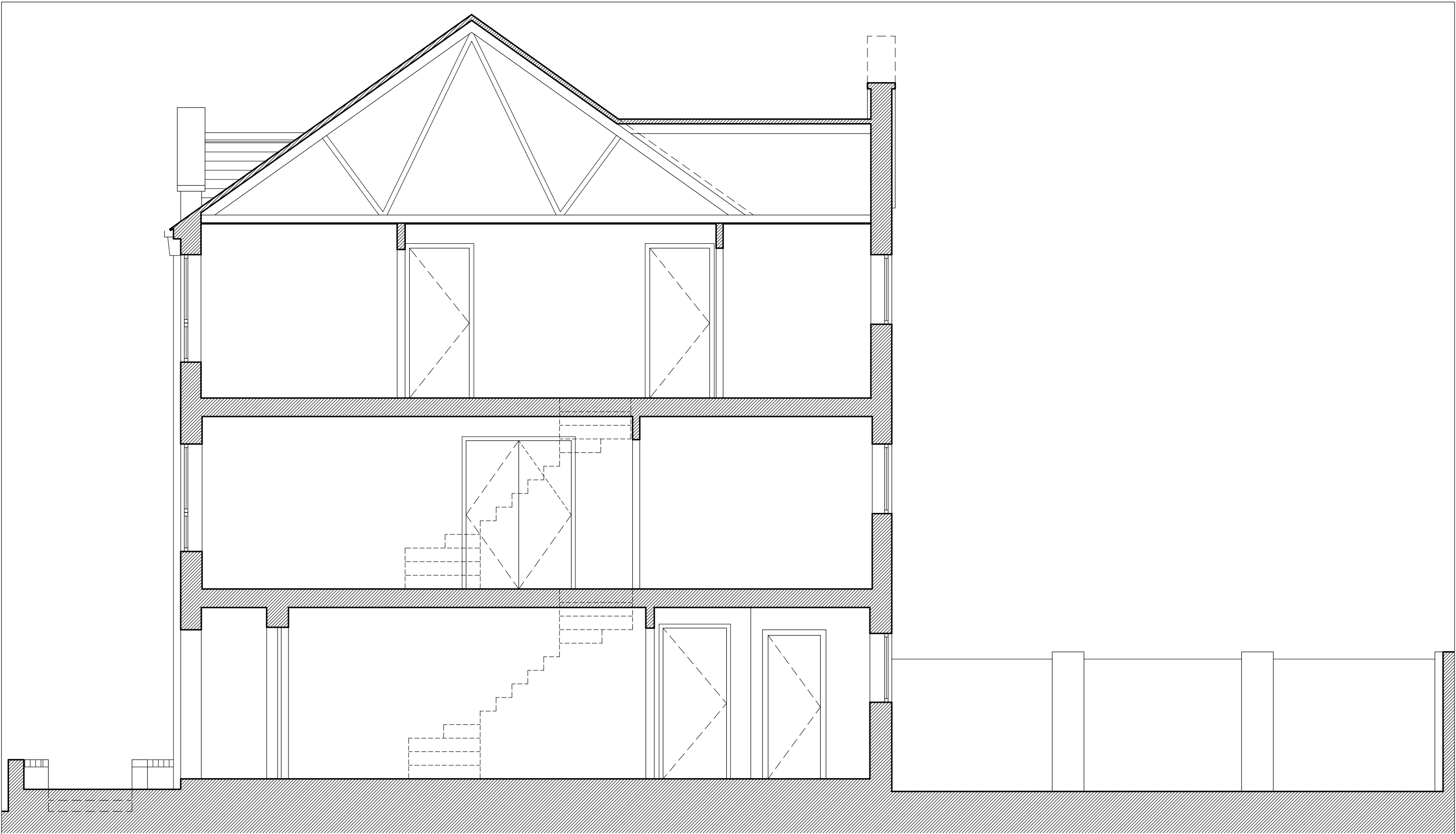
EXISTING SECTION B-B