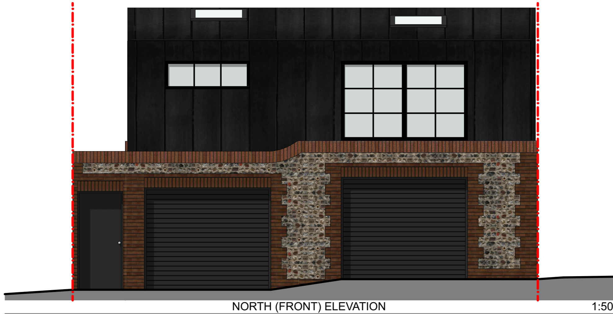
NORTH (FRONT) ELEVATION