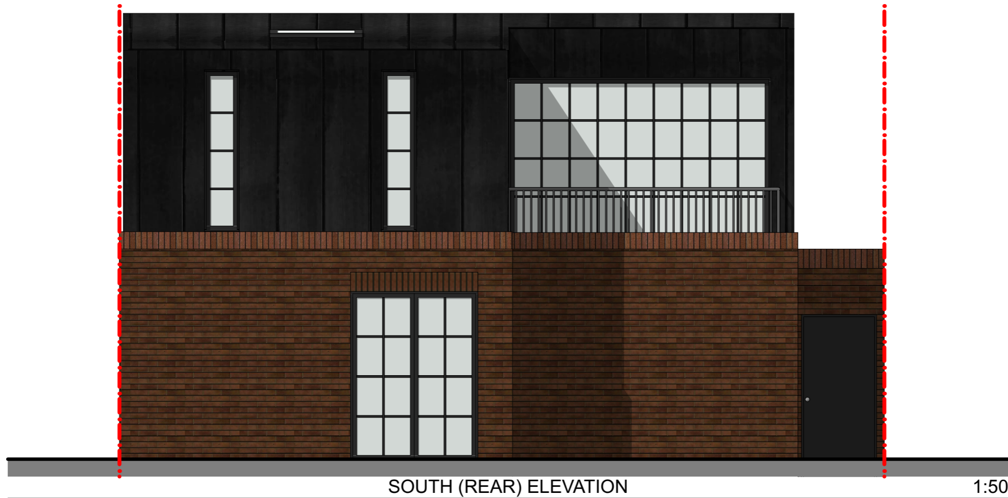
SOUTH (REAR) ELEVATION