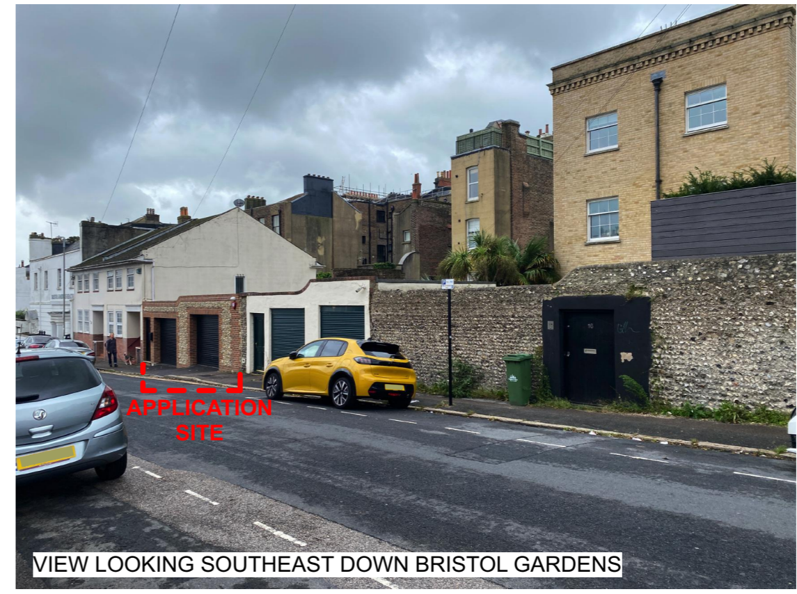
VIEW LOOKING SOUTHEAST DOWN BRISTOL GARDENS