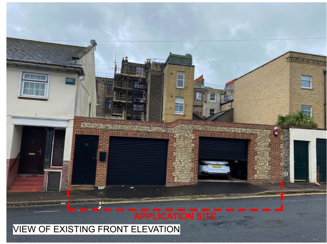
VIEW OF EXISTING FRONT ELEVATION