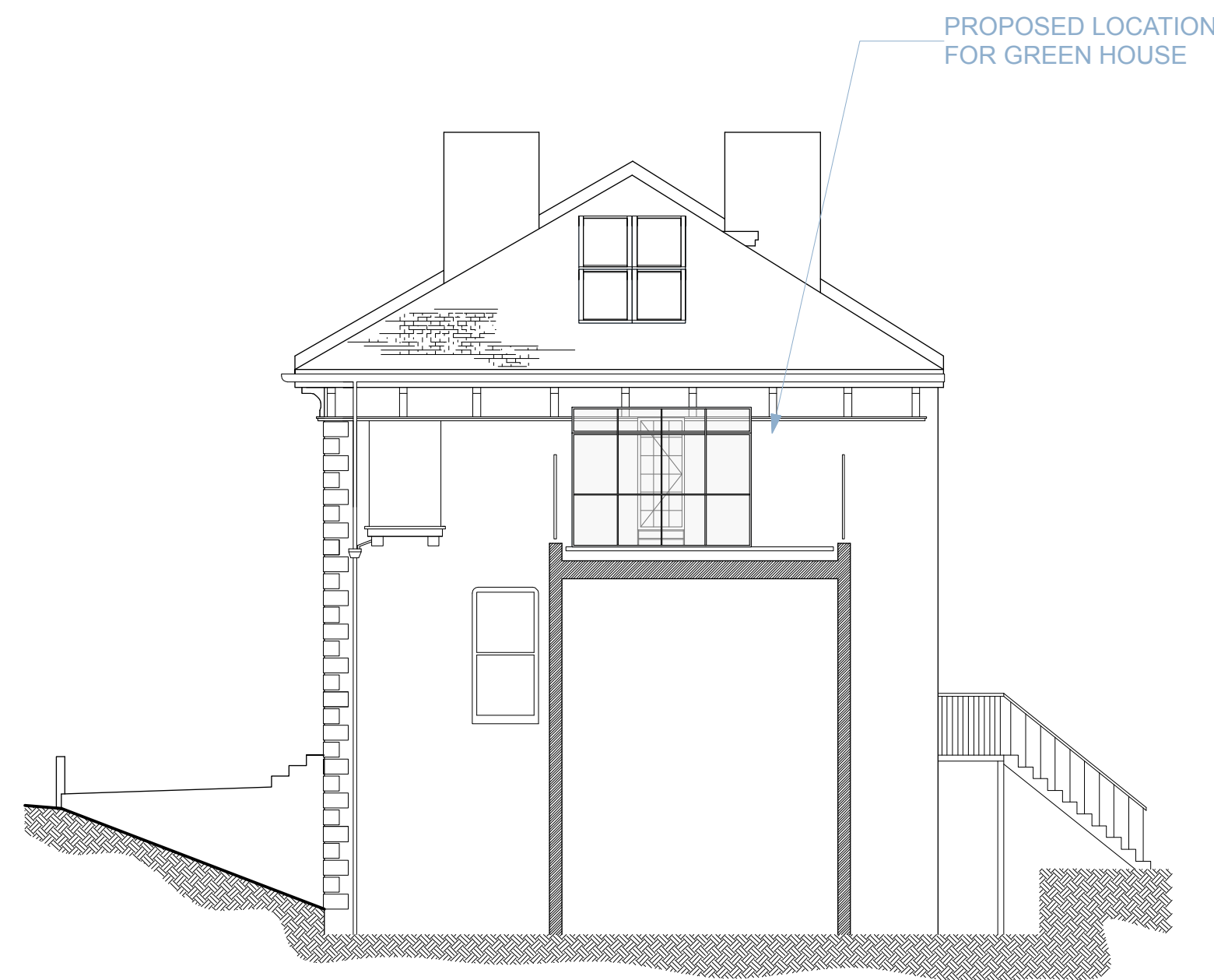
2 PROPOSED - SIDE (WEST) ELEVATION Scale - 1:100