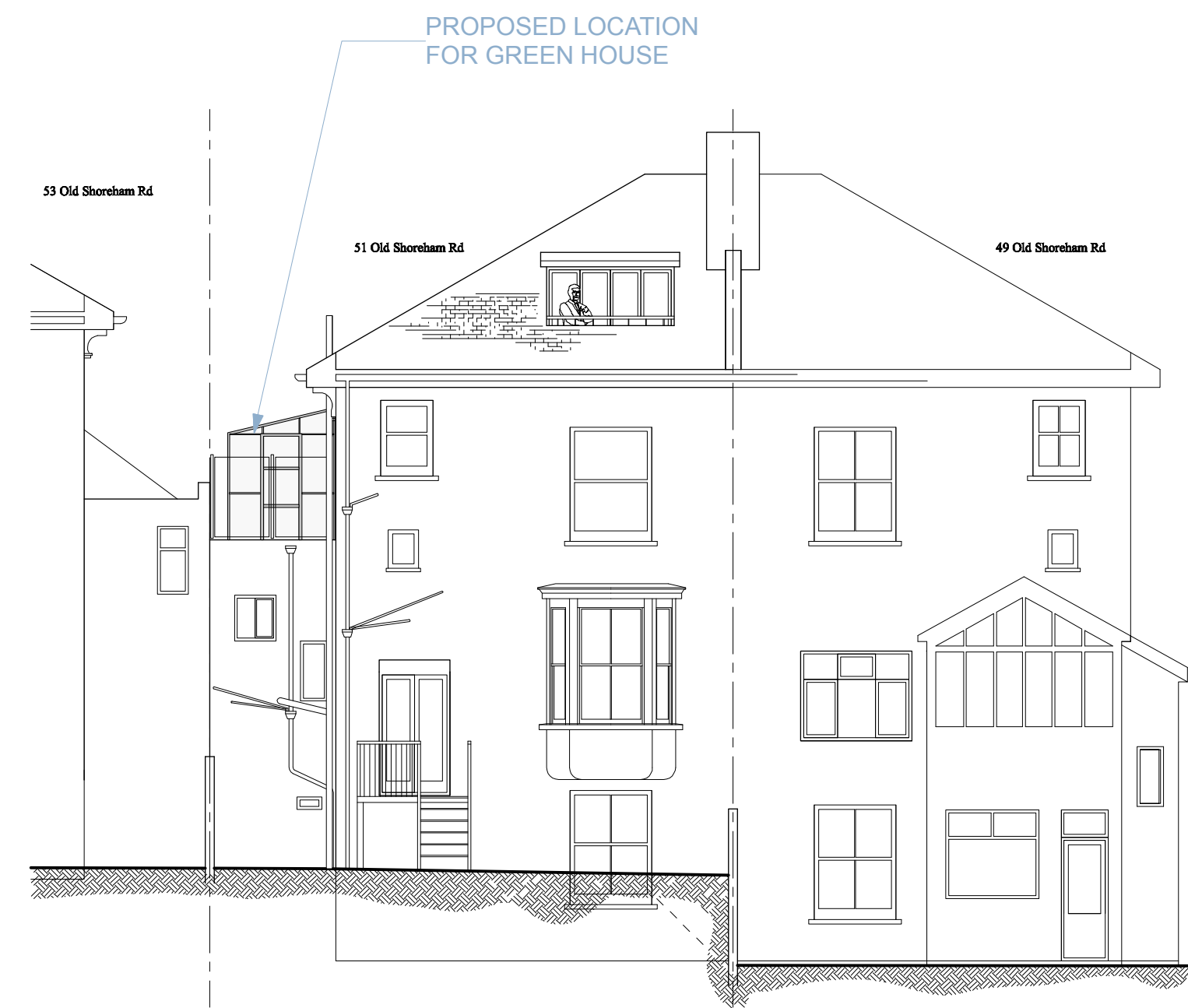
1 PROPOSED - REAR (SOUTH) ELEVATION Scale - 1:100