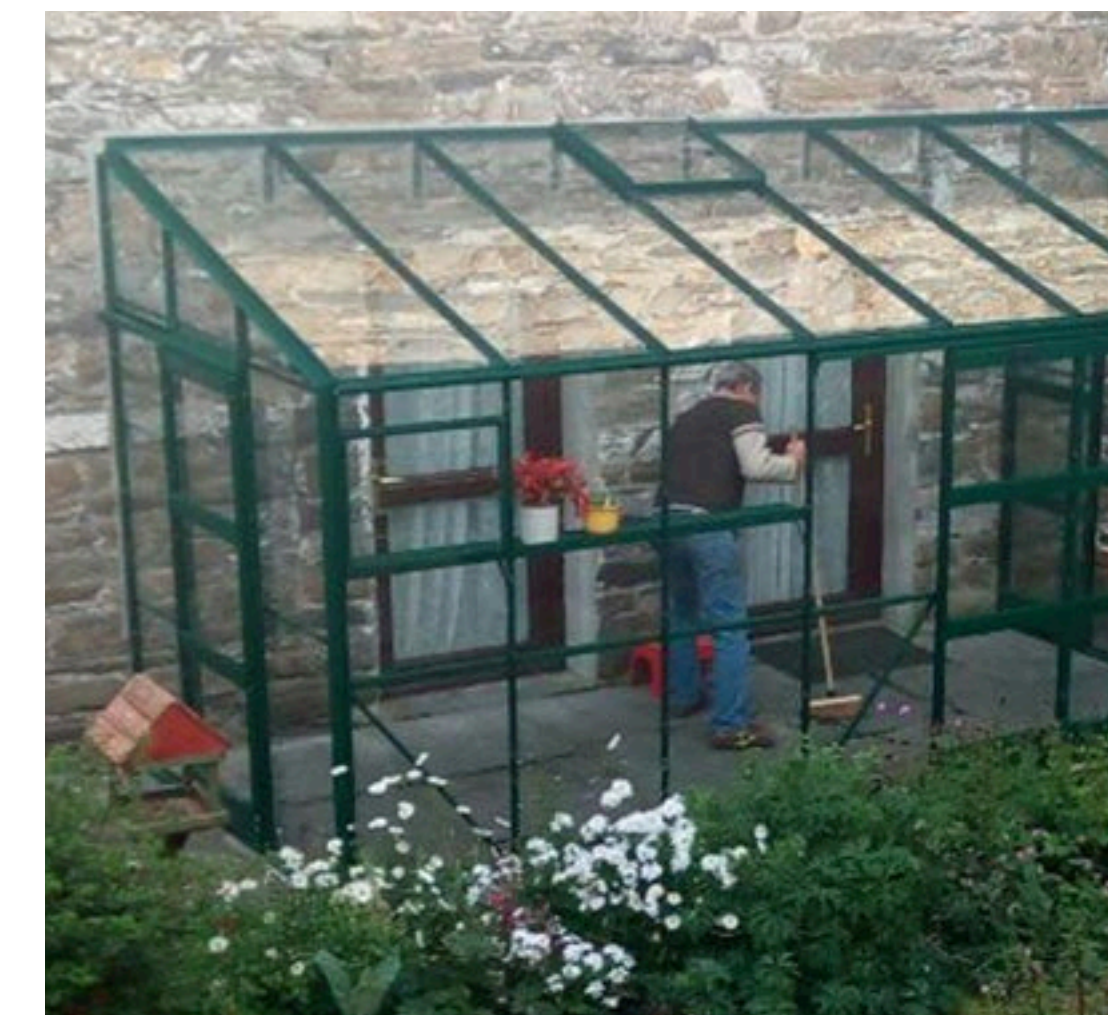
6 EXAMPLE OF PROPOSED GREEN HOUSE Scale - 1:100