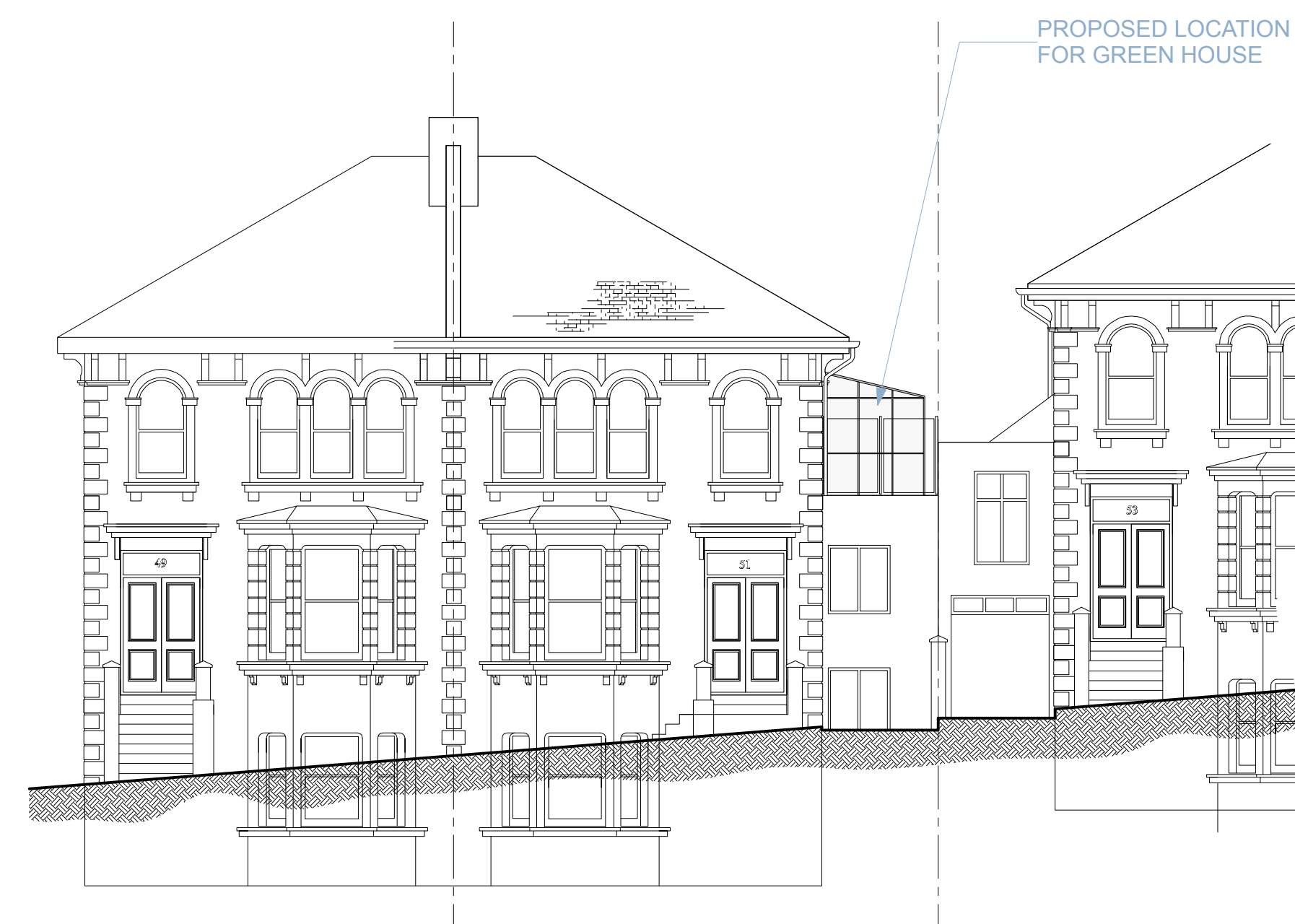
3 PROPOSED - FRONT (NORTH) ELEVATION Scale - 1:100