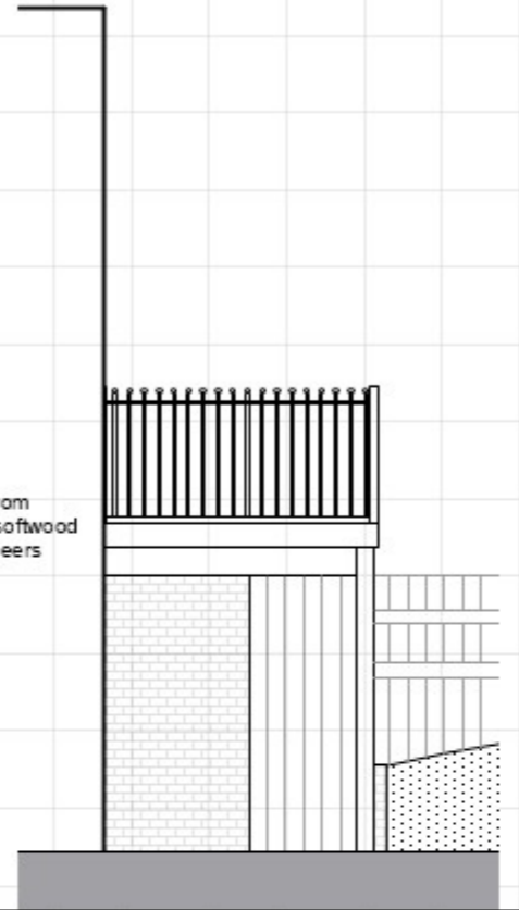
North Elevation Proposed