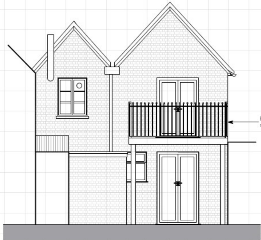
East Elevation Proposed