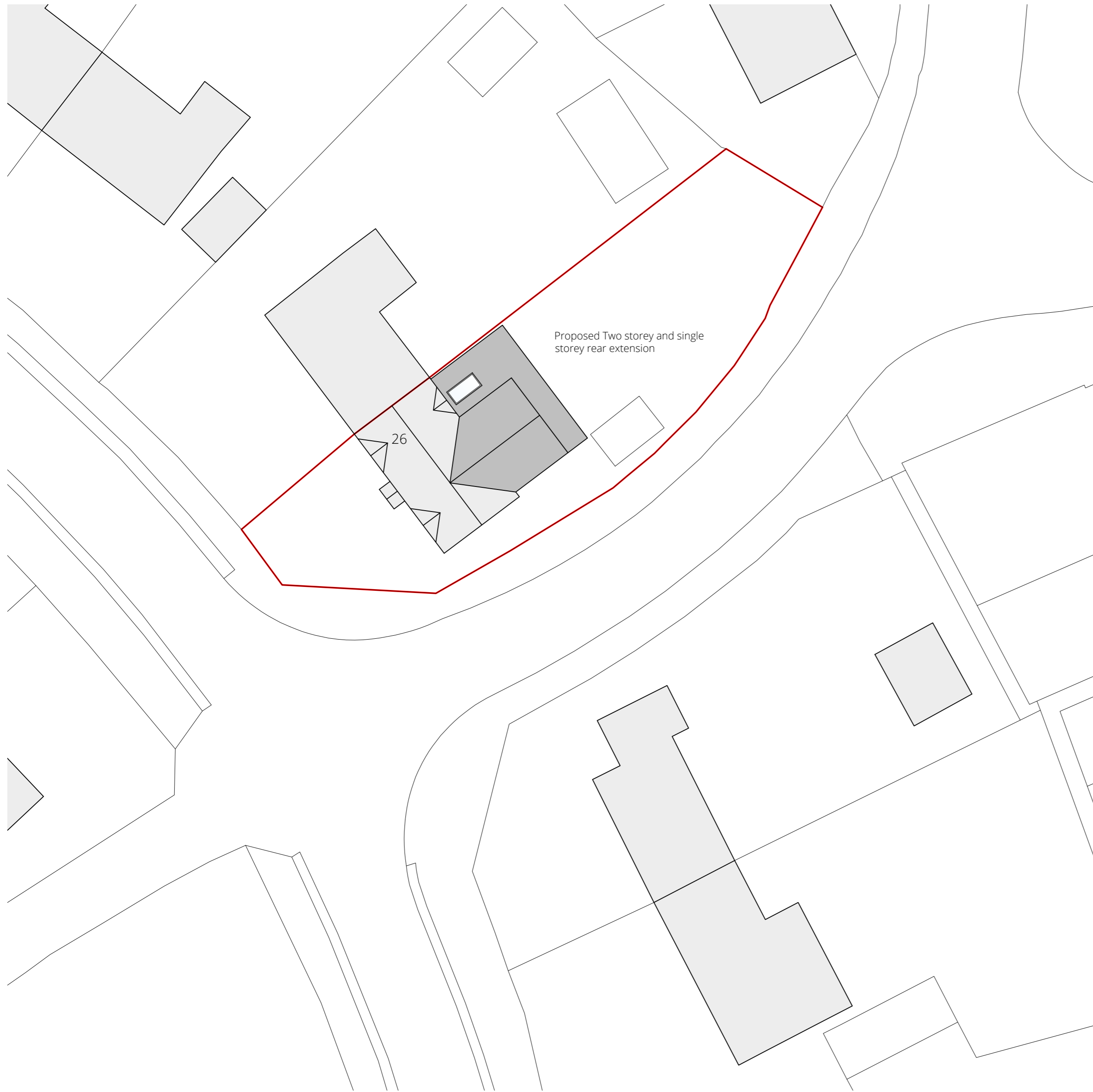
BLOCK PLAN AS PROPOSED Scale 1:200