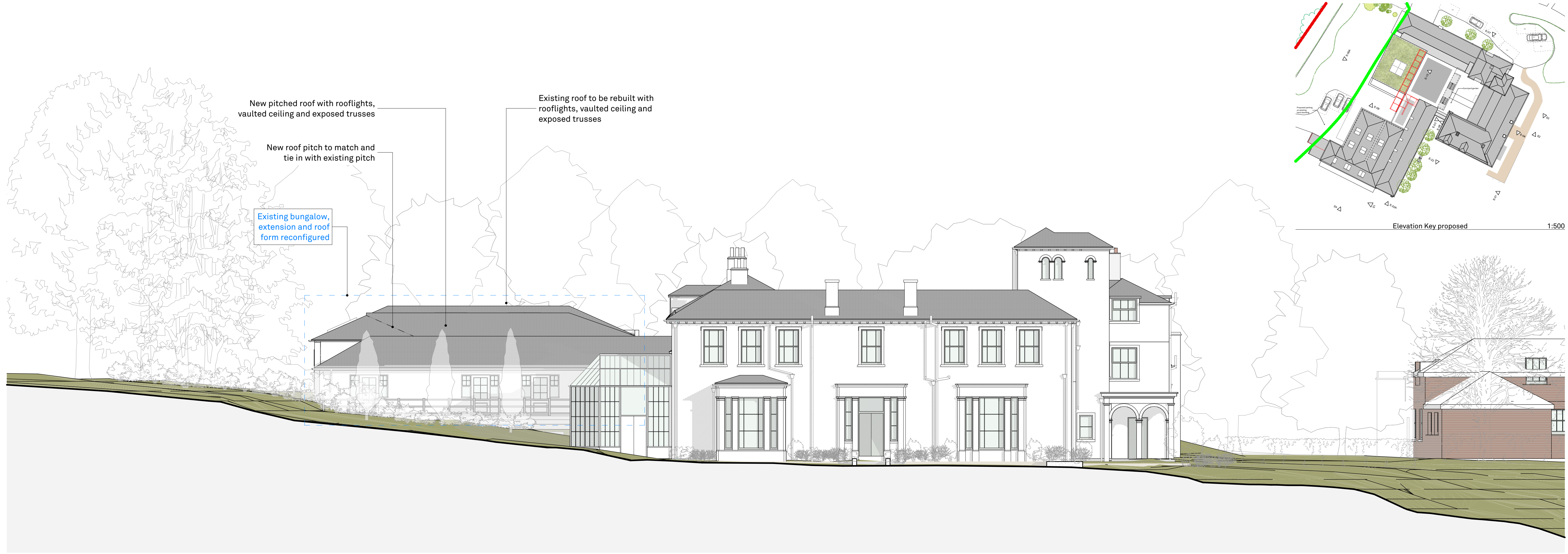
Elevation Key proposed 1:500